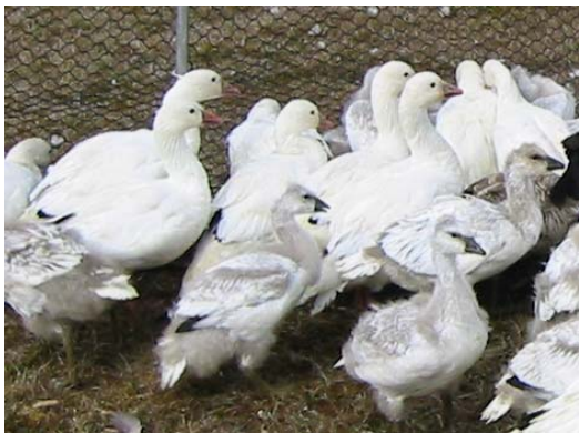
Species: Chen rossii Ross's Goose

The goal of the survey is twofold: to characterize the strains of avian influenza viruses and to ensure early detection of highly pathogenic avian influenza strains in wild birds in Canada. Expanding on the 2005 nation-wide survey of influenza virus strains of wild ducks, this survey places a greater focus on birds that migrate regularly between Canada's North Atlantic region and Europe or that spend some part of their year in close proximity to birds that winter in Europe. The expansion of the survey complements work being carried out in the United States, which is surveying western (Pacific Flyway) populations.