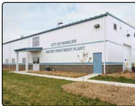
Water Treatment Facility, Winkler