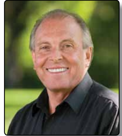
The Honourable Ron Lemieux Minister of Local Government

We are proud of the work that has been done and is underway to build quality infrastructure and transportation networks in this province. We will continue to invest in our Province's future.