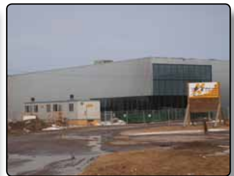
Regional Community Centre, Thompson