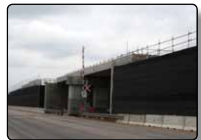
Perimeter Highway, Winnipeg