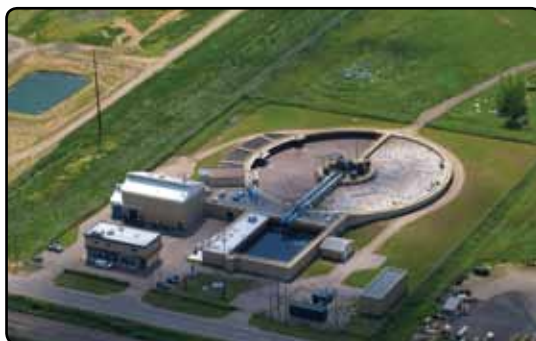
Wastewater Treatment Facility, Brandon

Upgrades to the Brandon wastewater treatment plant will increase the treatment capacity of the municipal waste stream. In turn, this will allow for commercial and residential growth in the area, as well as ensure compliance with the Manitoba's Nutrient Management Strategy.