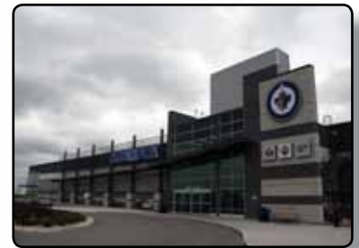
MTS Iceplex, Winnipeg

Investments are also being made in initiatives that help protect communities from natural disasters, support a cleaner environment through improved wastewater treatment, and provide residents with more opportunities to engage in sport activities.