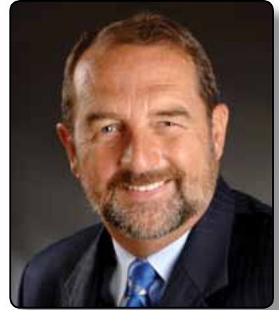
The Honourable Denis Lebel, P.C., M.P.

Working together, we will accomplish more and ensure Canada remains well-positioned for the future.