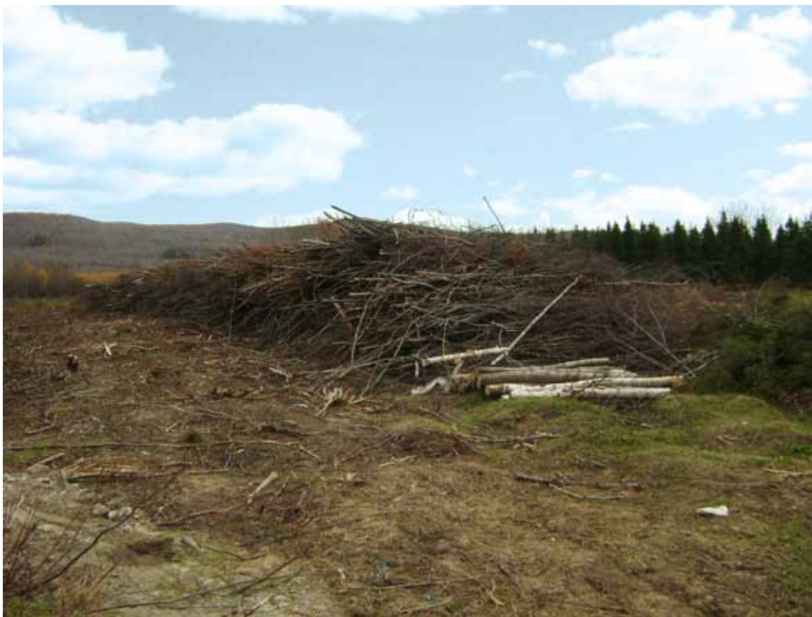
Harvesting residue in Québec stacked at roadside in preparation for processing into biofuel.