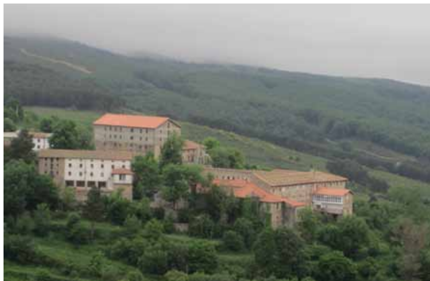
A distant view of the Montesclaros Monastery.