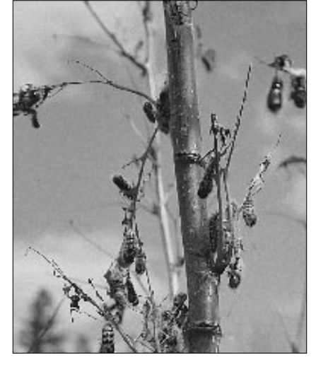
Figure 6. Rolled leaves containing pupae indicate a satin moth infestation.