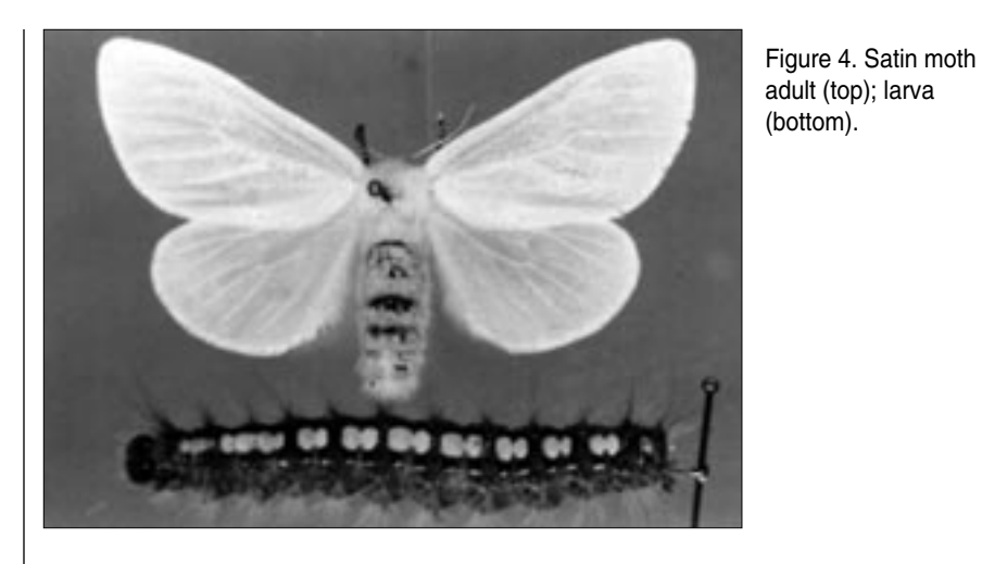
Figure 5. Feeding damage caused by satin moth larvae.

often contributes to population collapse. Four species of parasites were released in British Columbia from 1929 to 1934, including three wasps -Apanteles melanoscelus (Ratzeburg), Eupteromalus nidulans (Thomson) and Meteorus versicolor (Wesmael) and a fly - Compsilura concinnata Meig. Eupteromalus nidulans is the only one which did not become successfully established. The braconid, A. melanoscelus, is particularly effective; 90% of some satin moth larval collections are parasitized by A. melanoscelus. However, it is subject to hyperparasitism, the incidence of which can reach 70% (Forbes, 1968).