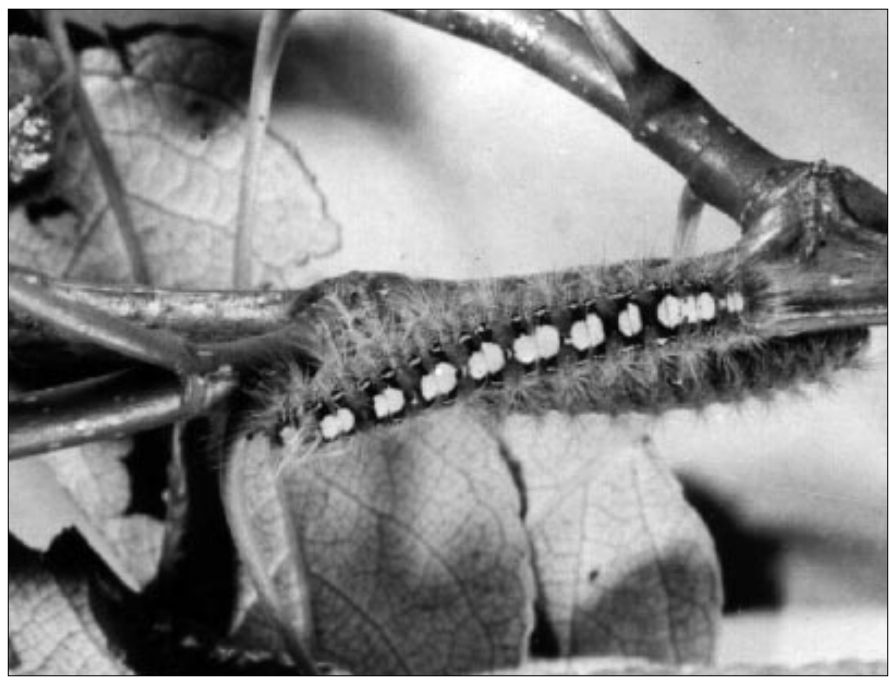
Figure 1. Larva of the Satin Moth

Major hosts of the satin moth have historically been exotic poplars, espe-