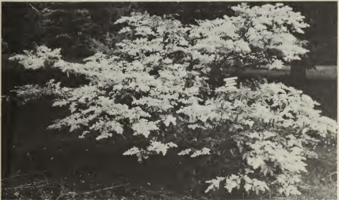
Ligustrum sinense 'Stauntonii' CHINESE PRIVET

L. tulipifera TULIP TREE Decid tree (50 m), 18 m high, 16.5 cm diam in 58 years; leaves odd-shaped; flowers yellow, green, and orange, tuliplike; blooms in June and July; durable, no pests; excellent. Massachusetts to Wisconsin, south to Florida and Mississippi. Z5b.