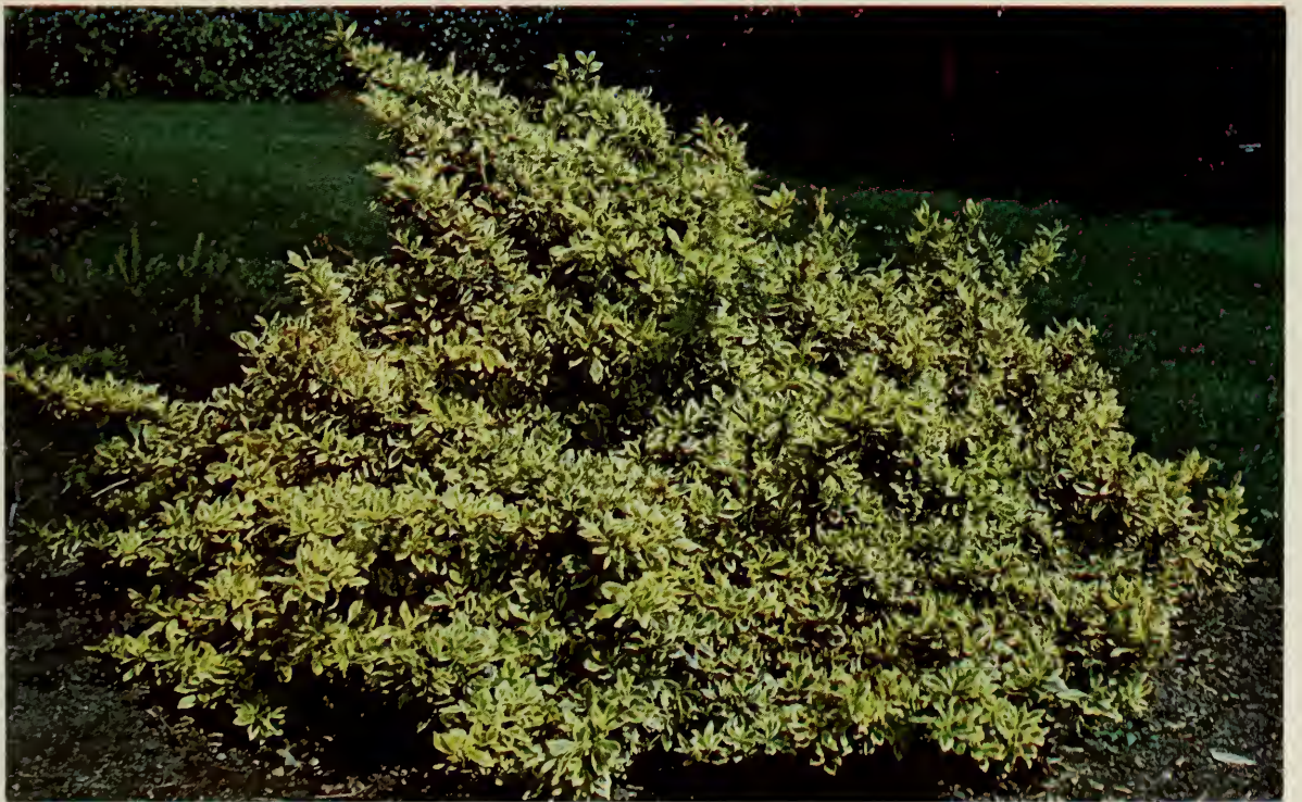
Euonymus fortunei variegata Wintercreeper