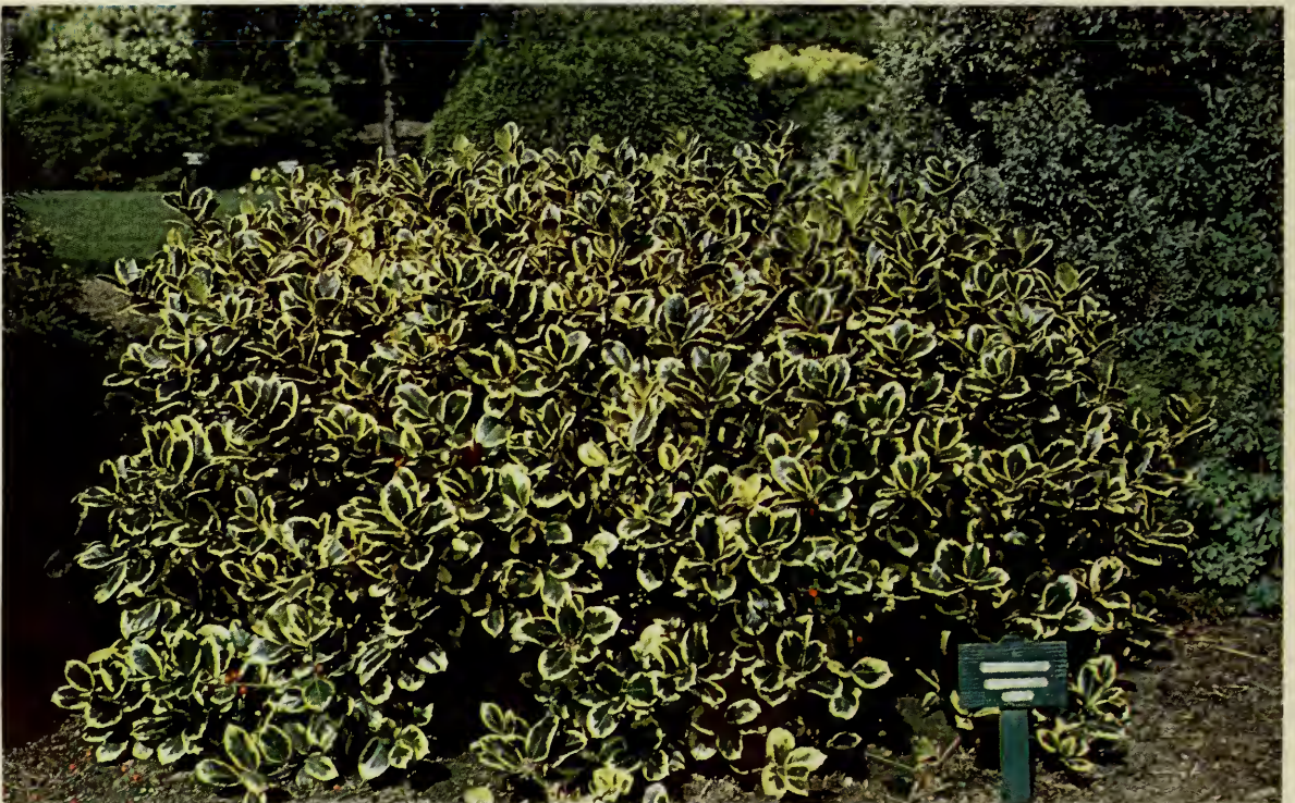
Ilex aquifolium 'Golden Queen' English Holly