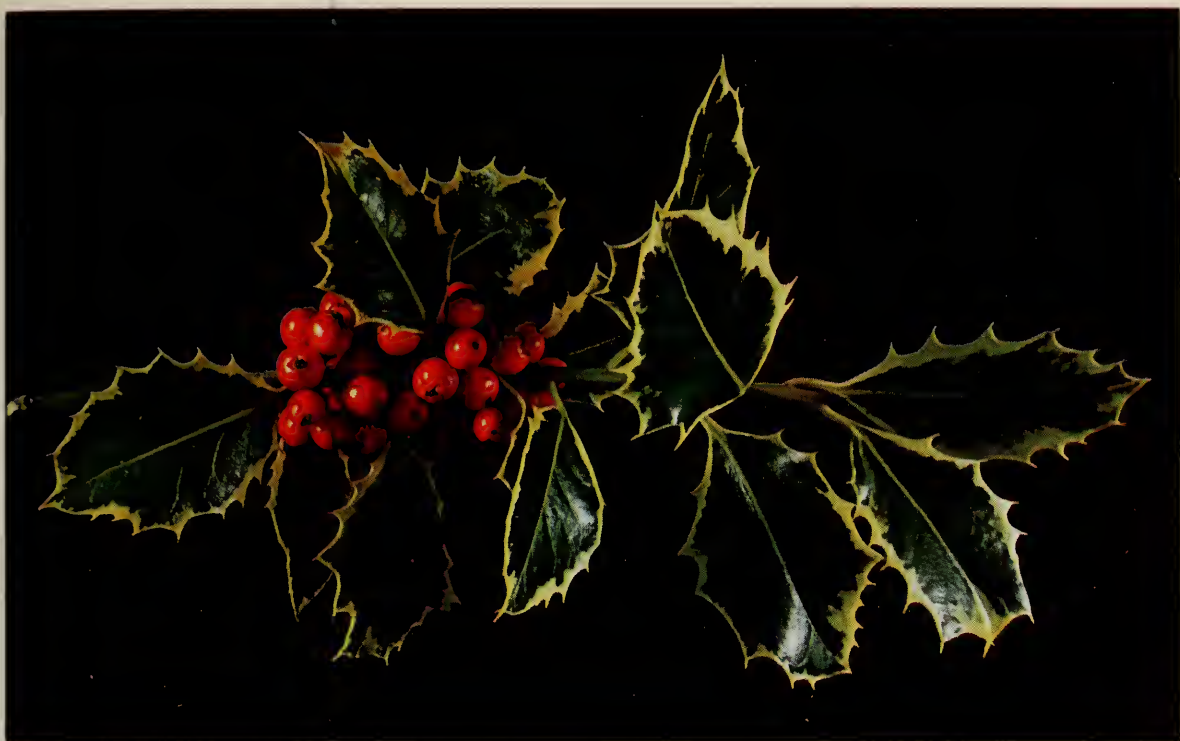
Ilex aquifolium 'Silvary' English Holly