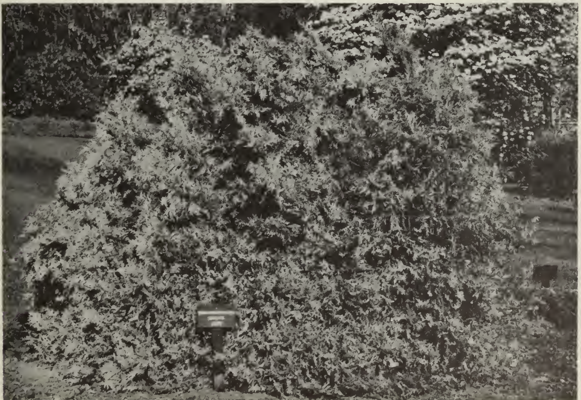
Thuja occidentalis 'Rheingold'

T. plicata GIANT ARBORVITAE, WESTERN RED CEDAR Tree, long-lived, timber species (58 m), beautiful at any height; makes excellent hedge or screen when