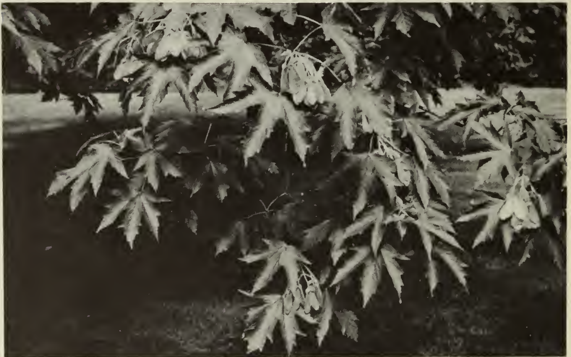
Acer trautvetteri TRAUTVETTER'S MAPLE

A. tataricum TATARIAN MAPLE Decid shrub or tree (9 m), 4.8 m high, 4.2 m spread at 34 years. S.E. Europe, W. Asia. Z2b.