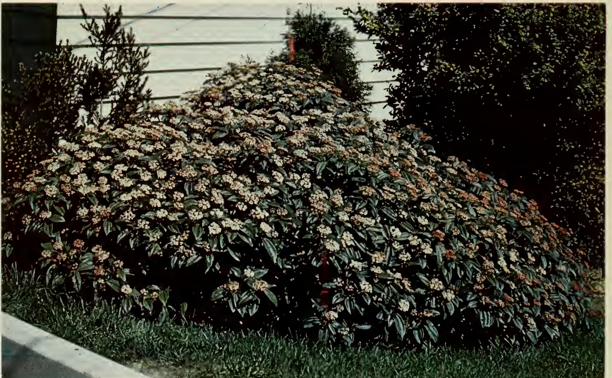
Viburnum davidii David Viburnum