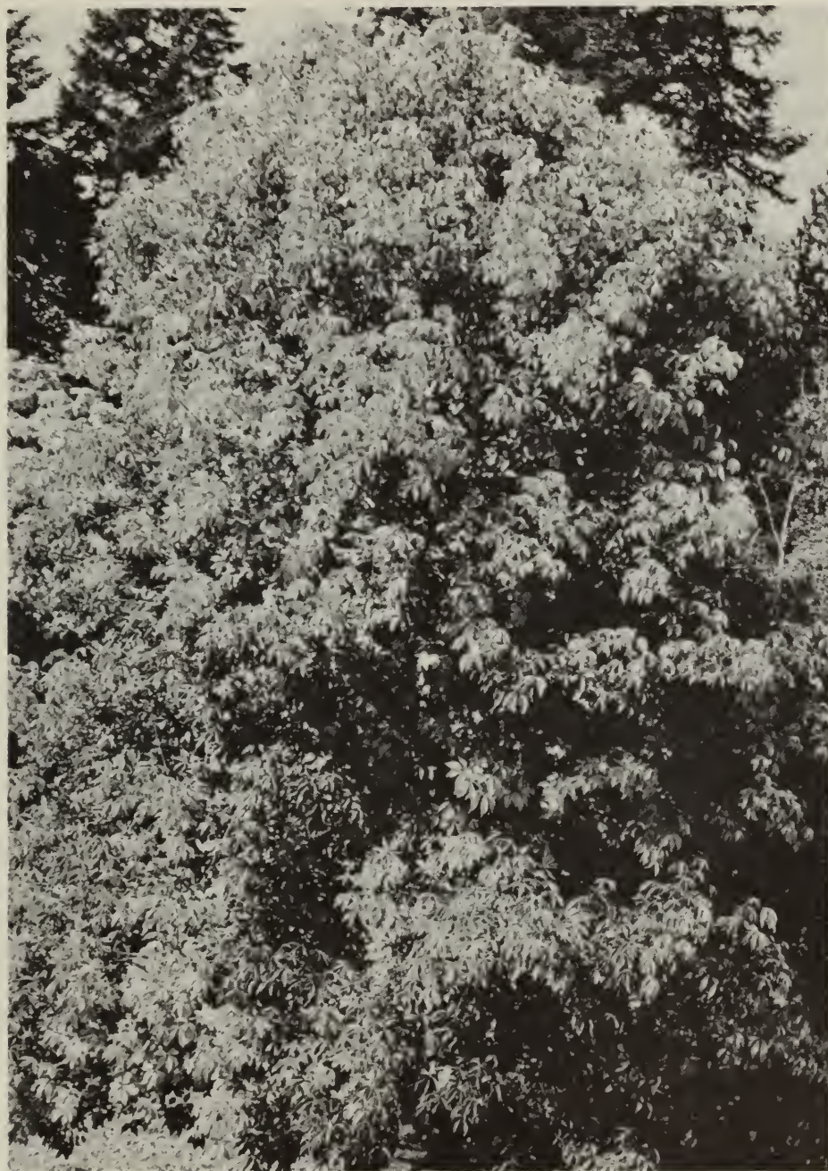
Aesculus glabra OHIO BUCKEYE

A. glabra OHIO BUCKEYE Decid tree (10 m), 15 m high, 9 m spread, 1.3 m circum at 58 years; flowers whitish with pink spots, colorful fall foliage. Pennsylvania to Alabama and Nebraska.