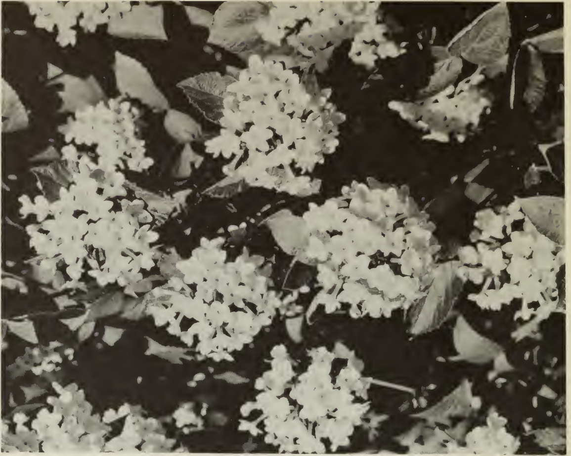
Viburnum × juddii JUDD'S VIBURNUM

V. × juddii ( V. carlesii × V. bitchiuense ) JUDD'S VIBURNUM Decid shrub, vigorous, 1.6 m high, 2.1 m spread at 19 years; flowers sweetly scented, pink-tinted April to May; excellent. Z5.