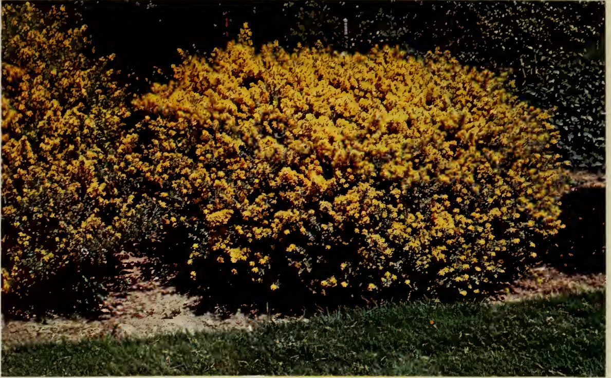
Genista tinctoria Dyer's Greenweed