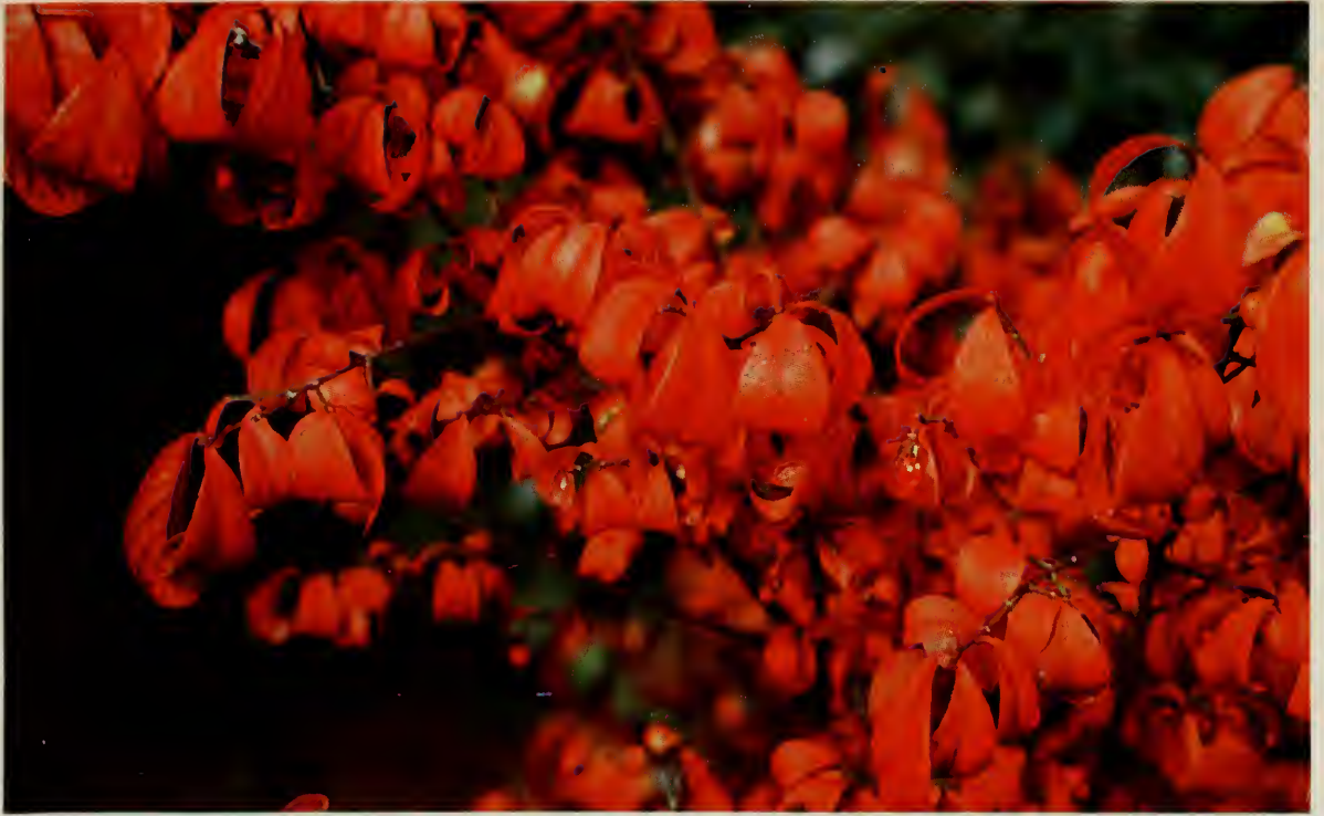
Euonymus alba 'Compacta' Winged Spindle Tree