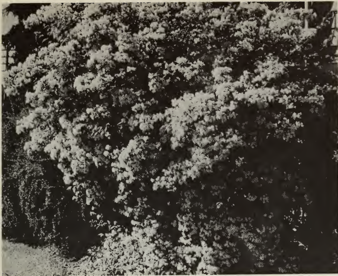
Kolkwitzia amabilis BEAUTY BUSH