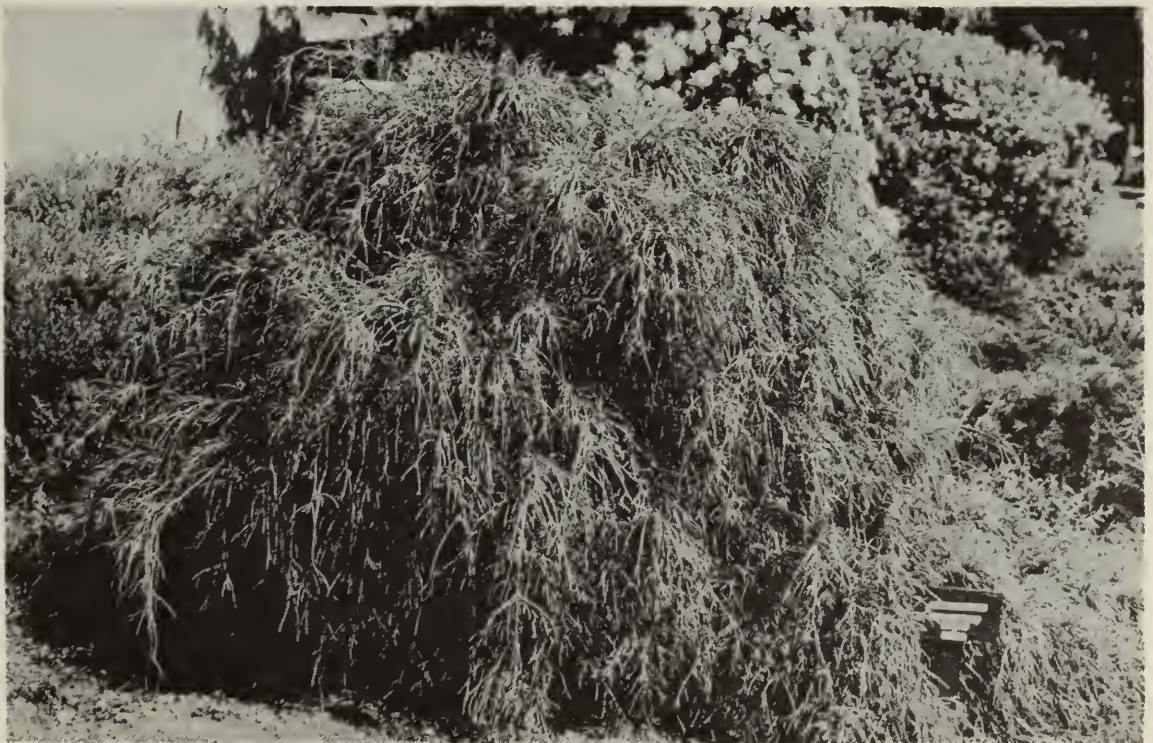
Chamaecyparis pisifera 'Filifera Aurea' THREAD SAWARA CYPRESS