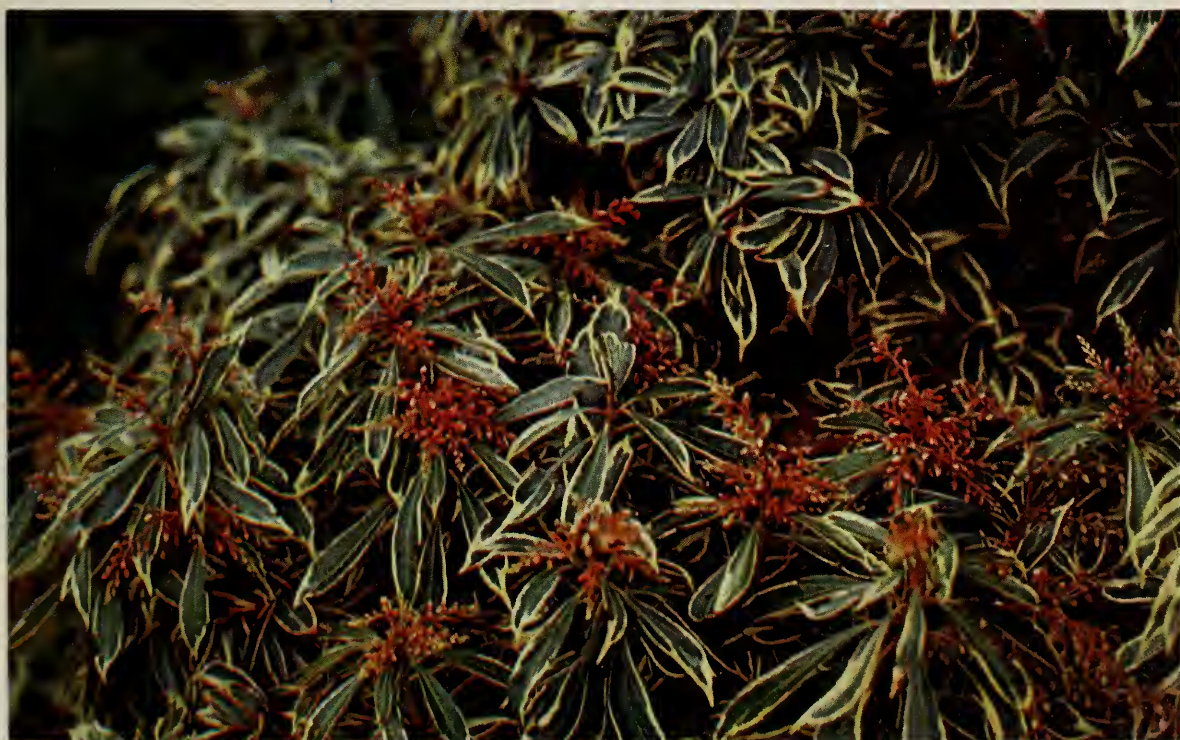
Pieris japonica 'Variegata'