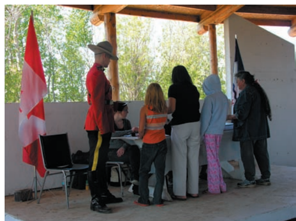
Treaty Payment in Fort Resolution, June 22, 2007