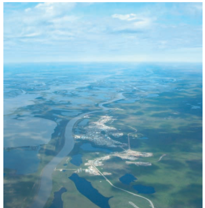
Field Services staff visited Inuvik in June to meet with the Gwich'in Tribal Council and Inuvialuit Regional Corporation.