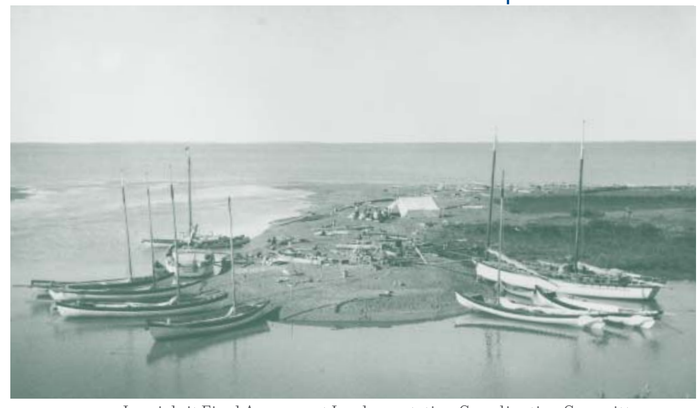
Inuvialuit Final Agreement Implementation Coordinating Committee