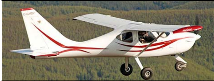
Photo 3. Amateur-Built Glastar, C-GMDP

The Aero Sport Power O-360-A2A engine is assembled by Aero Sport Power based in Kamloops, B.C. These engines are built using parts purchased from various suppliers who hold Parts Manufacturing Authority (PMA) granted by the United States Federal Aviation Administration (FAA). The Aero Sport Power O-360-A2A can be described as a non-certificated clone of the Avco Lycoming O-360-A2A engine, which holds type certificate number E-286 issued by the FAA.