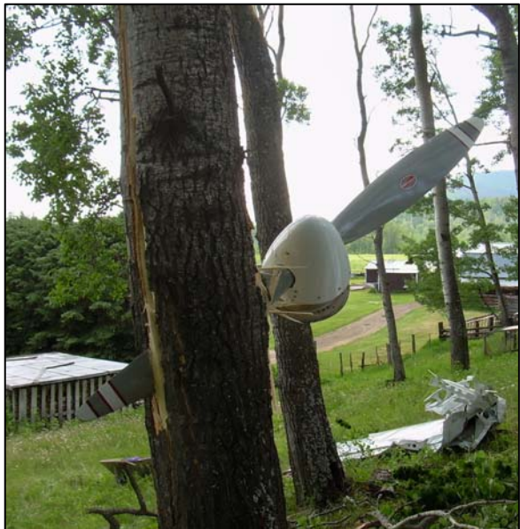
Photo 2. Propeller from C-GMDP

The pilot in the left-hand seat held a Canadian private pilot licence valid for single-engine land and sea planes. The pilot in the right-hand seat held a Canadian ultra-light aeroplane licence and recreational pilot permit issued on the basis of a Swiss private pilot licence for land and sea aeroplanes with the following restrictions: