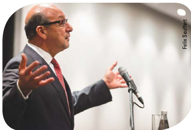
Minister Trevor Manuel opens the Exchange

Trevor Manuel, the Minister responsible for the South African National Planning Commission, gave the keynote address. The event featured a broad range of presentations grouped around TTI's core themes of policy impact, research quality and organizational effectiveness. A Knowledge Expo, open throughout the event, showcased the achievements of the think tanks.