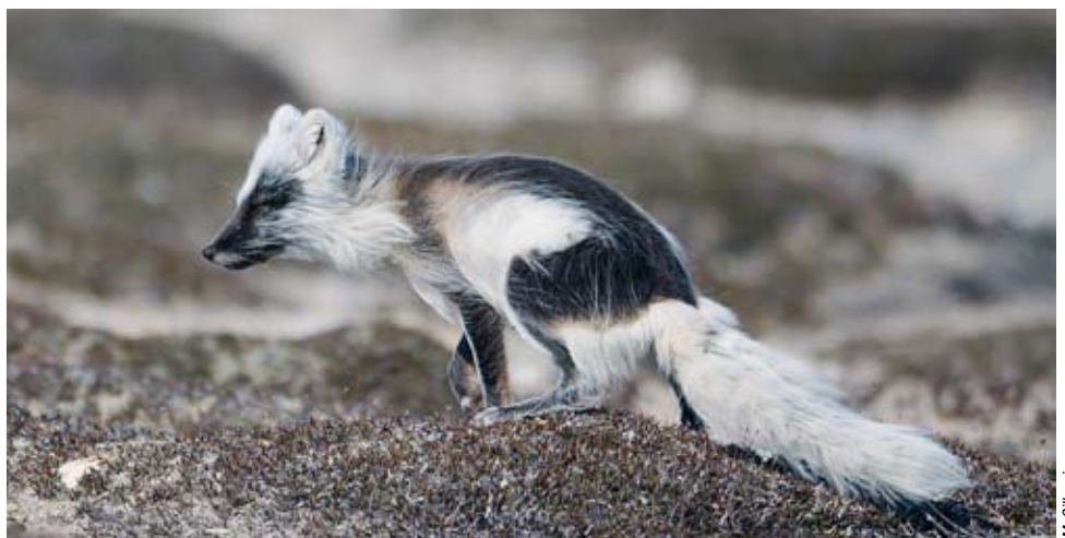
Adult arctic fox molting winter coat

We began monitoring fox dens in the mid-1990's looking at the distribution of arctic and red fox dens. We also wanted to collect baseline information on the