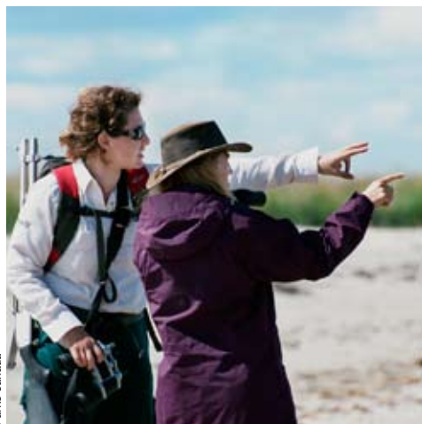
A visitor explores Wapusk NP with Parks Canada staff