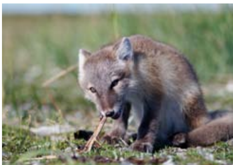
Arctic fox pup chewing goose leg bone

One of the factors that will likely influence the change in distribution of red and arctic foxes is global warming. As temperatures in northern regions continue to get warmer, the environment as we know it today will change, perhaps favouring the habits of the red fox over its cousin the arctic fox. Will arctic foxes adapt to these changes or will they move further north following the polar bears? Only ongoing monitoring will tell.