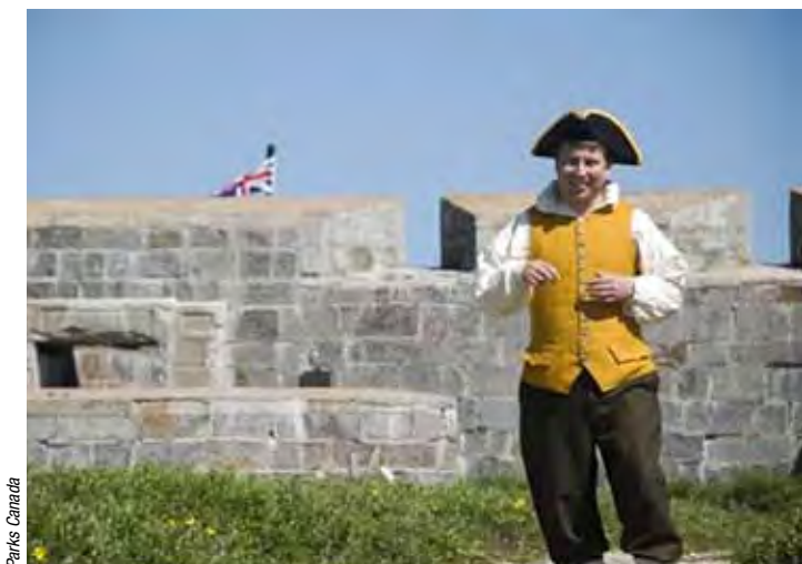
Join Parks Canada for “A Day at the Fort”, July 21st, 2012. Free activities and boat transportation for this event.

Come enjoy a morning of activities, history and fun at Prince of Wales Fort National Historic Site. Free boat transportation to the fort will be provided.