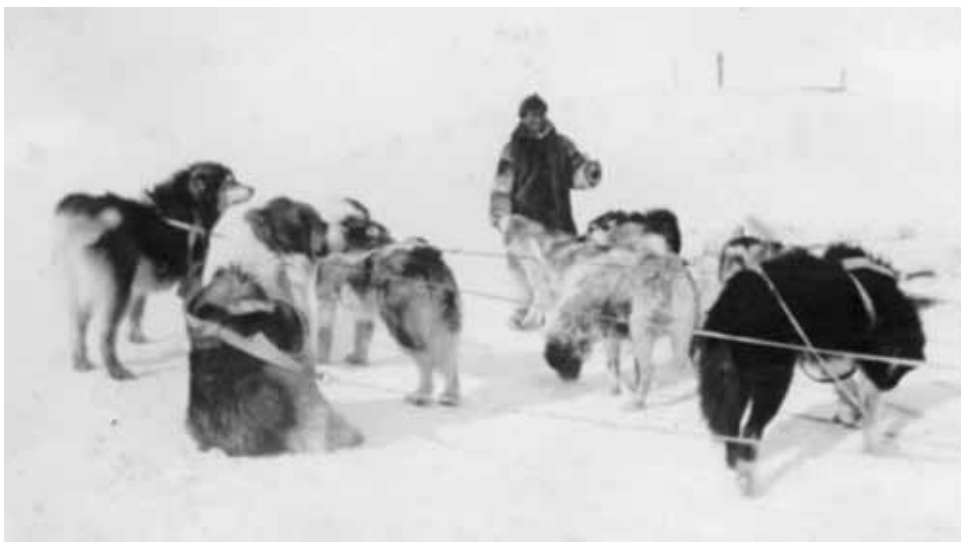
Churchill, MB 1930s. Inuk guide for Catholic missionaries' northern mail run