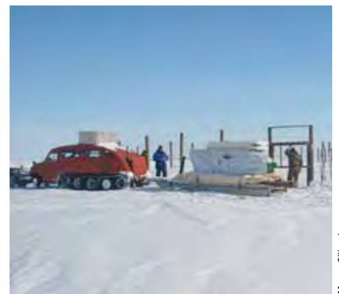
Clifford arriving at Broad River compound with a load of lumber in April, 2009