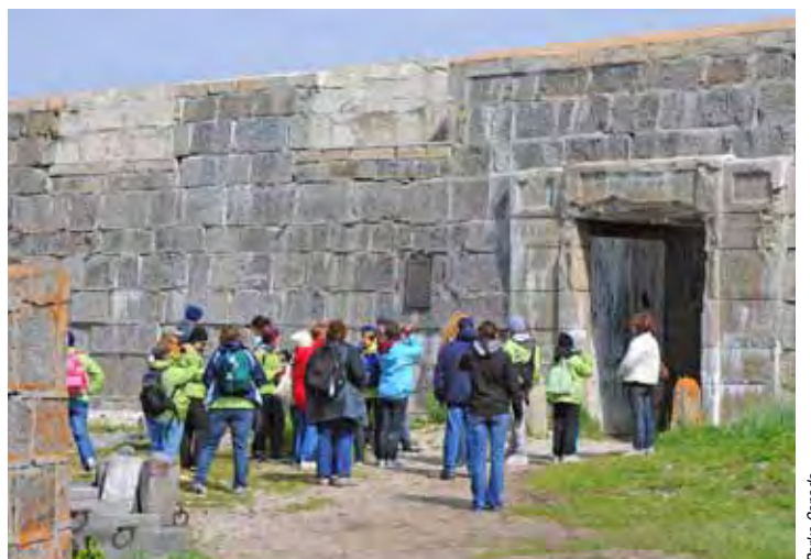
Visitors at Prince of Wales Fort National Historic Site