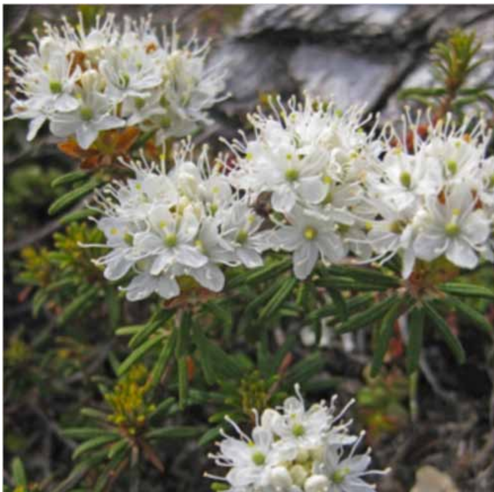
Dwarf Labrador Tea in flower

Many traditional uses for Labrador Tea have been reported (it's important to note that improper preparation of the plant can cause health complications). Aboriginal people and early Europeans made a hot beverage with it. Medicinal uses for the plant have also been described. Various oral preparations,