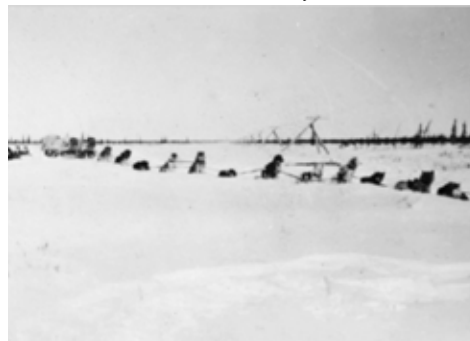
Churchill, MB 1930s. Freight team with large contingent of dogs