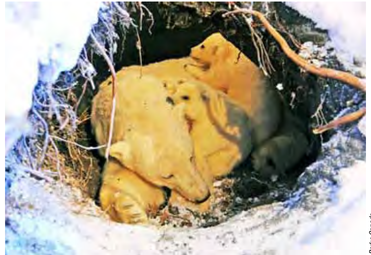
Life-sized Polar Bear Den Exhibit in the Parks Canada Visitor Centre, Churchill

Parks Canada in Churchill is pleased to offer special summer and fall programming. Tours and presentations by staff, researchers and guests are a regular feature at the Parks Canada Visitor Centre in the Heritage Railway Station. Other special events, including the exciting activities listed below, will take place at Prince of Wales Fort National Historic Site and in the Town of Churchill. Call Parks Canada for details; 204-675-8863 .