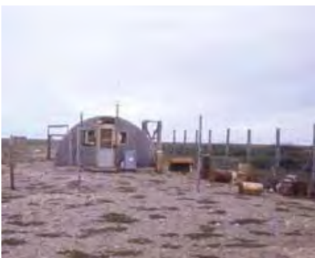
Nester One camp in the spring of 1973

Nester One field camp has changed considerably over the last 40 years and it continues to support a wide range of research (including its initial core focus on nesting Canada geese) and provides a secure site for university students and Parks Canada staff to monitor and study this important ecosystem. While there are many challenges to operating and supplying a camp like Nester One, the work done there is important and staying there is an opportunity of a lifetime. Although the facilities have been modernized, the nearest neighbour is still more than 20 kilometers away, and perhaps best of all, there is still no cell phone service or Internet access.