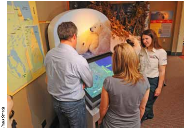
Tour of the Parks Canada Visitor Centre in Churchill's Heritage Railway Station