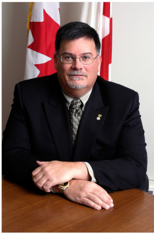
Don Head Commissioner