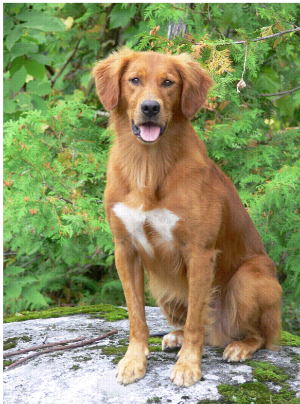
Racer: Moving from doghouse to penthouse