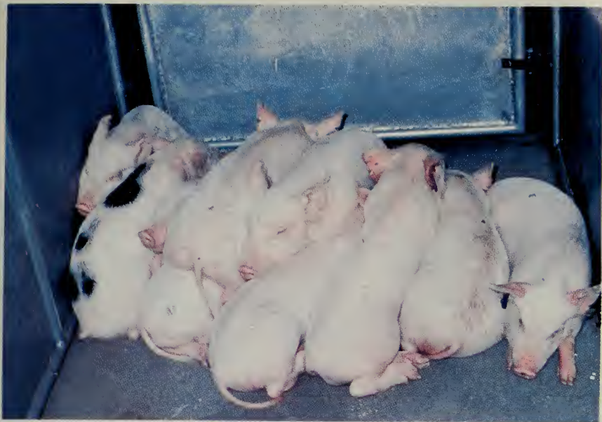
Infected swine often pile up.