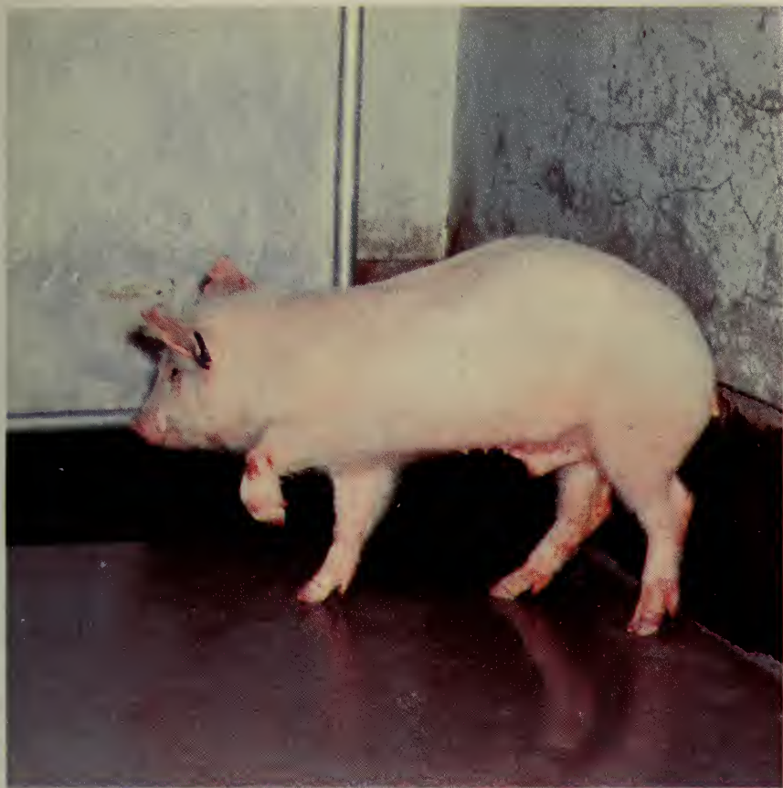
Pigs may develop a high-stepping gait.