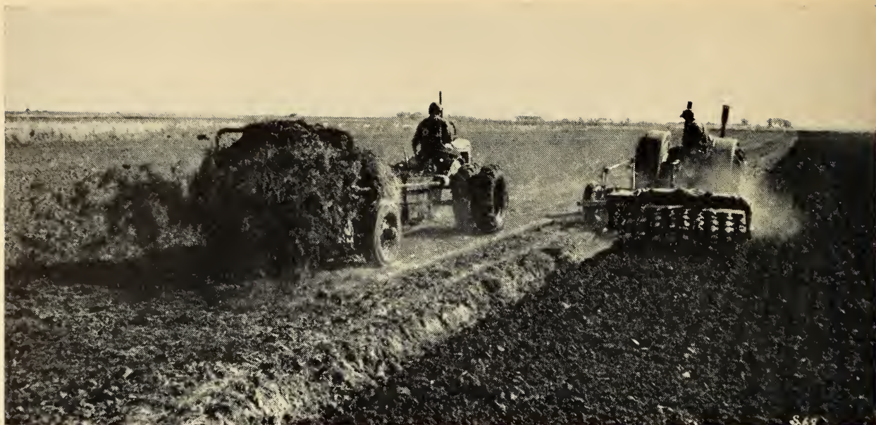
Figure 4.—Plowing under well-rotted manure in early fall provides a fertile field for the next crop.

seeding, and make sure that the seeded crop has plenty of moisture. Strawy manure tends to hold back the crop because, during decay, it uses up some of the nitrogen and moisture needed by the seedlings.