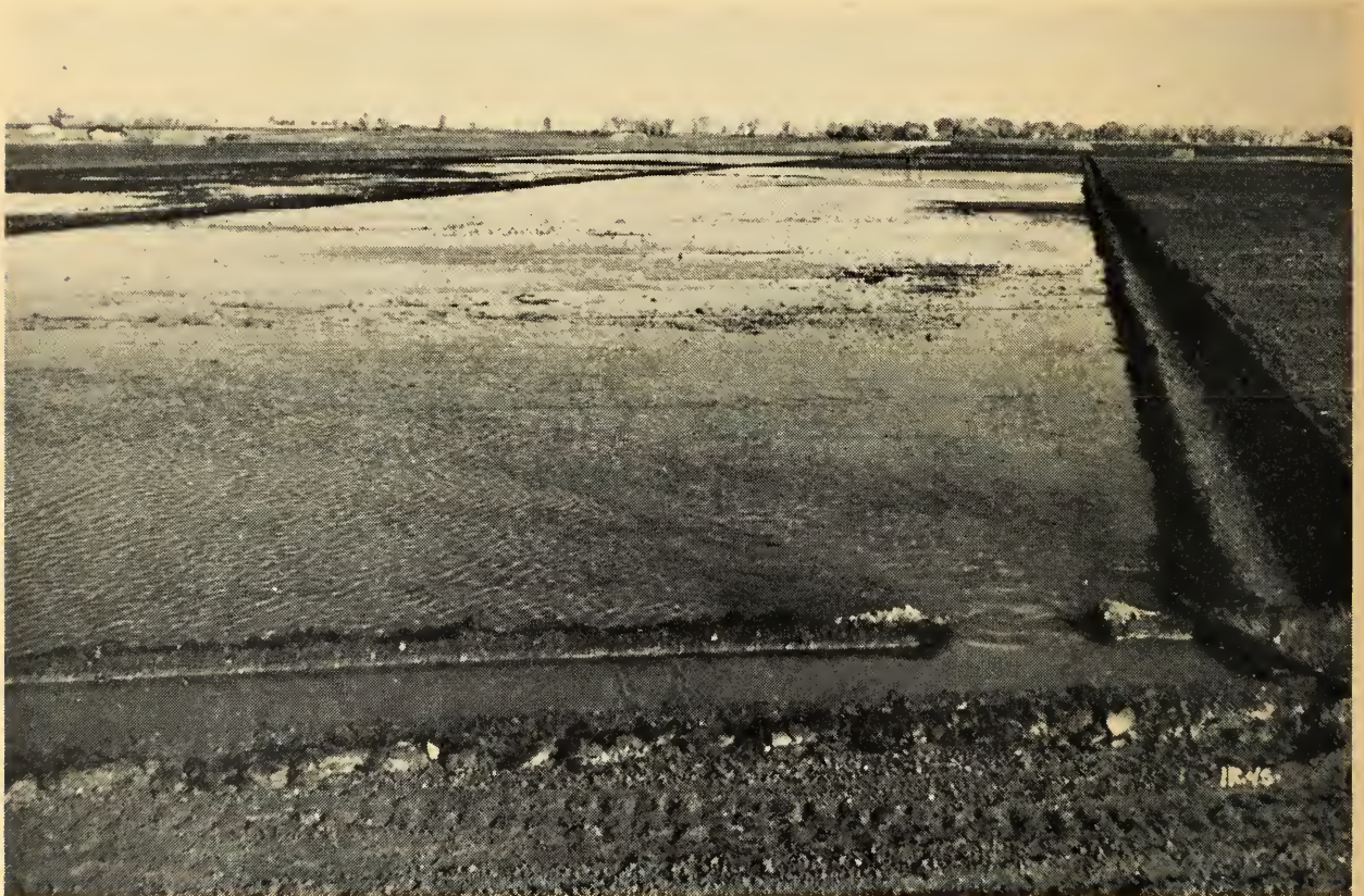
Figure 2.—A well-leveled field is irrigated from border ditches.

Alfalfa seed needs a fine, firm, moist seedbed. It is easier to prepare such a seedbed on fall-plowed than on spring-plowed land. For satisfactory irrigation, make sure that the field is level (Figure 2).