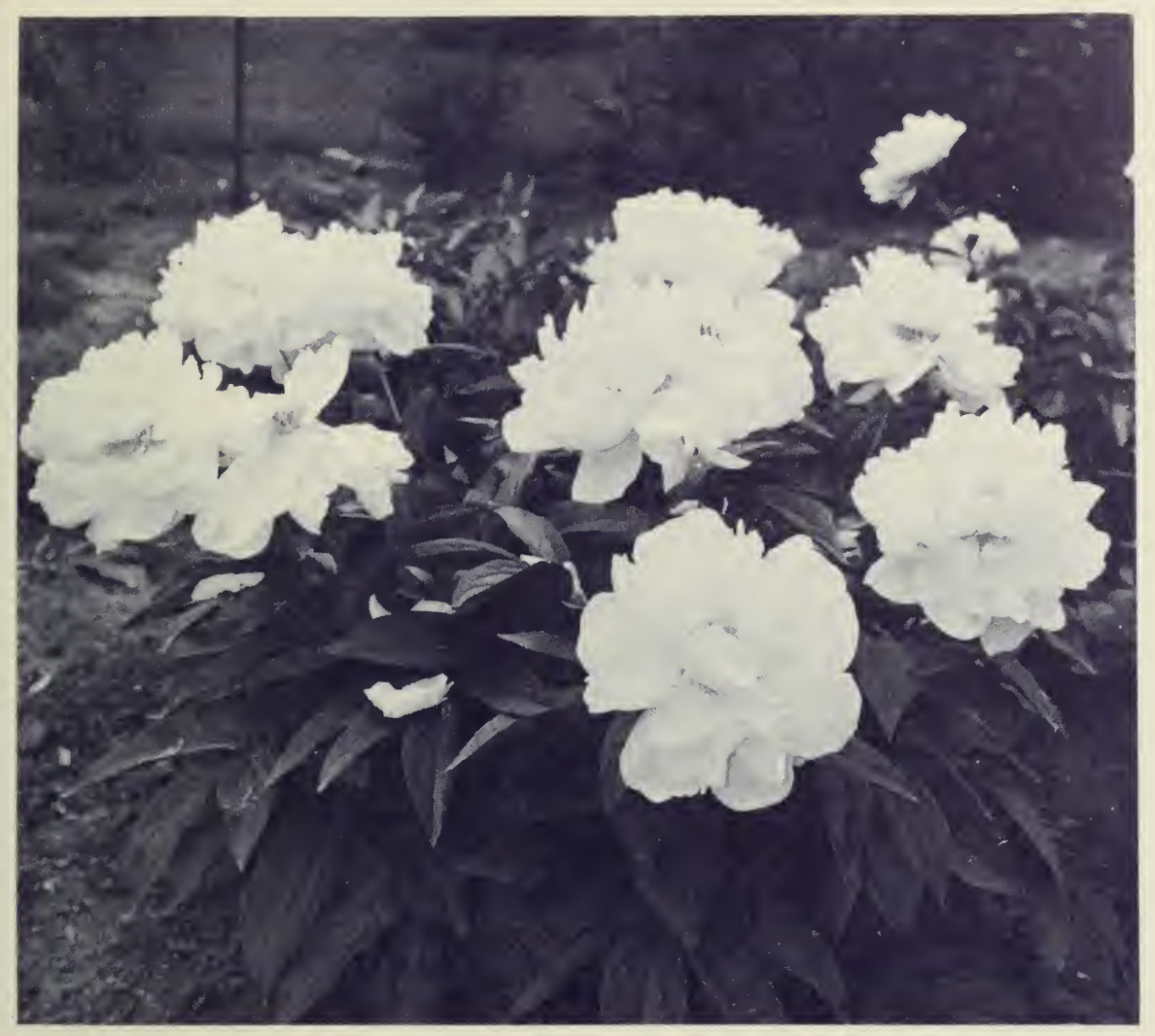
Peonies make an impressive show, and are the hardiest perennials available for prairie gardens. Some of the most popular cultivars originated 50 to 100 years ago.