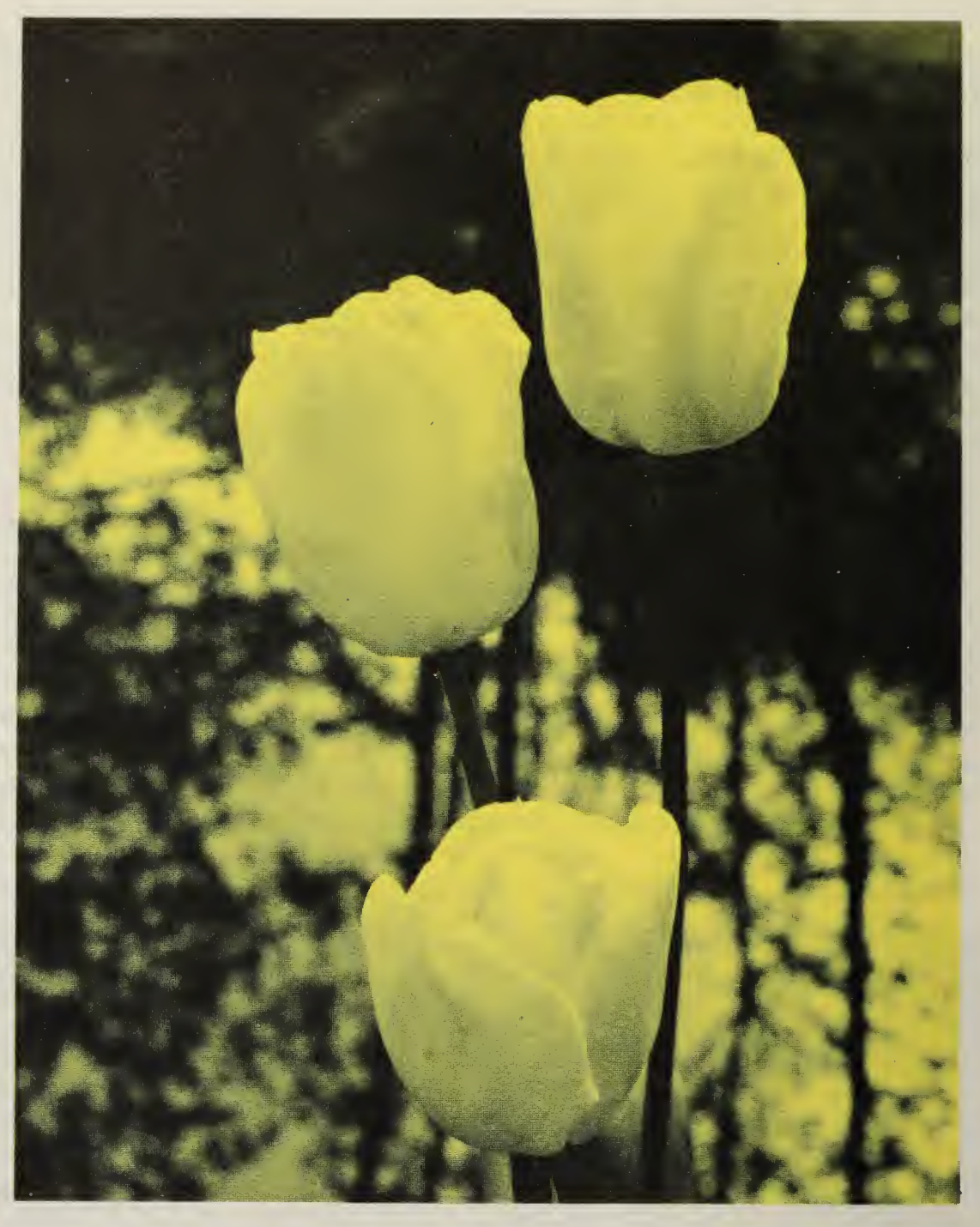
Darwin tulips, among the earliest blooming perennials, are available in a wide range of colors, heights, and sizes of bloom.

all shades of red, pink, and yellow as well as white; some have petals striped or picotee edged.