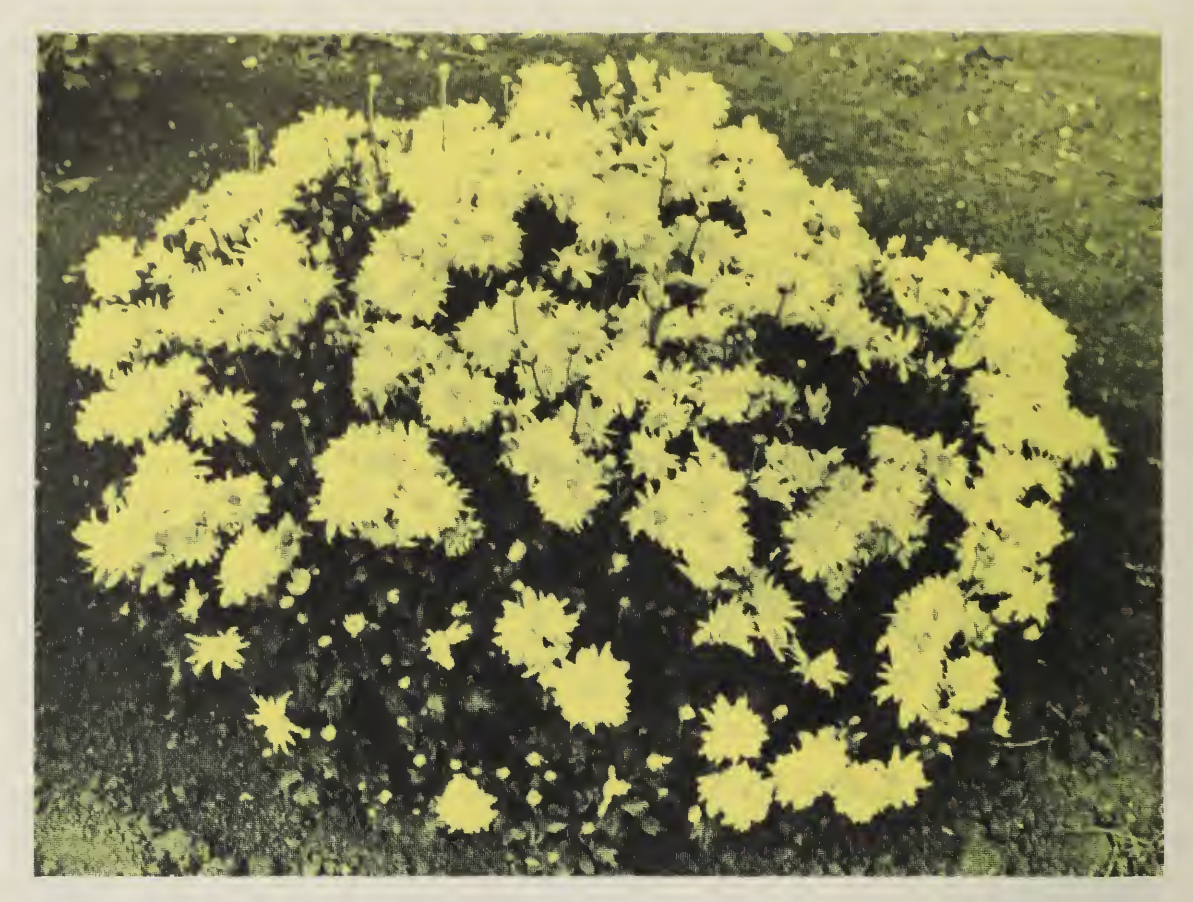
'Canary', one of the best chrysanthemums for the prairies. It has profuse, yellow, double flowers and healthy foliage.

Morden chrysanthemum breeding program. The best cultivars for the prairie region include the following: 'Morden Canary', 'Morden Eldorado', 'Morden Gaiety', 'Morden Bonfire', 'Minnesota Autumn', 'Morden Delight', 'Morden Garnet', 'Morden Cameo', 'Morden Everest', 'Susan Brandon', and 'Morden Fiesta'.