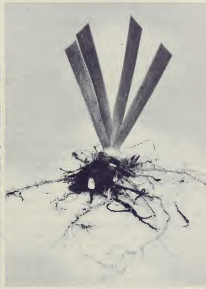
Above Bearded iris plant before division (left). Single division of bearded iris root (right). The fan of leaves is cut to an inverted \vee .

Opposite page Peony plant before division (left). Single division of peony root (right). The growth buds, or eyes, are just above the fleshy portion of the root (see inset).