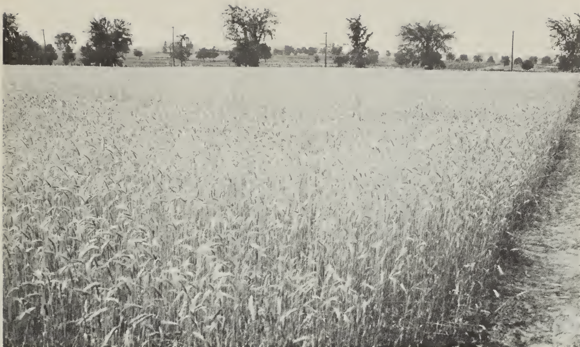
Figure 2. A productive field of fall rye.