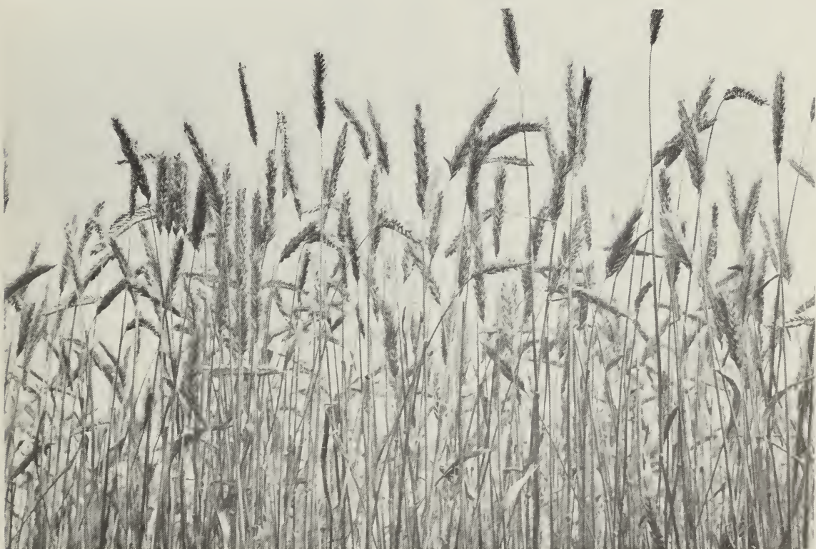
Figure 3. A mature stand of fall rye.