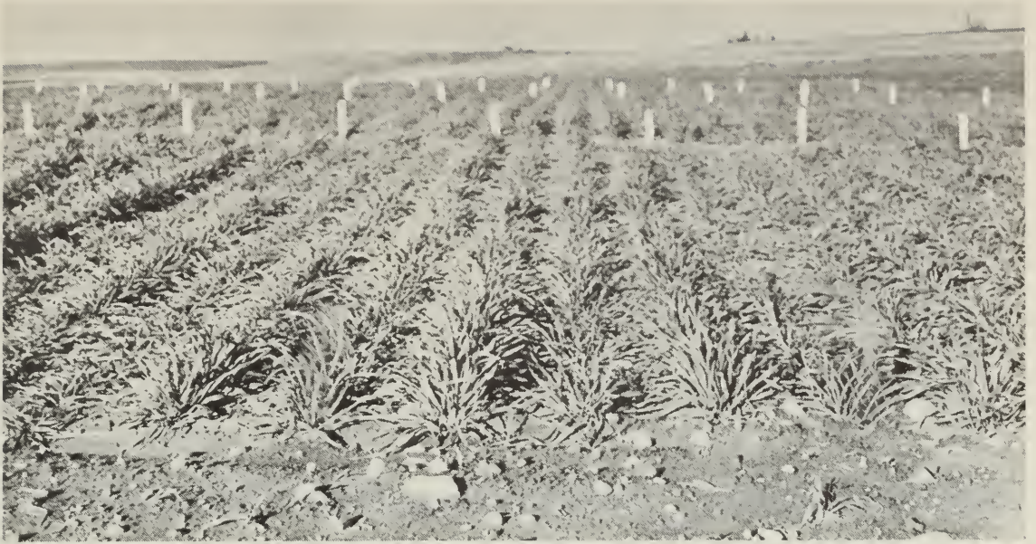
Figure 1. Test plots of rye varieties on November 8 after seeding on September 5. These strong, healthy plants are in good condition for overwintering.

fall rye, you should have a germination test on seed carried over for use in the next year. Since rye is cross-pollinated, be sure to prevent natural mixing of varieties: grow only one variety or, if two varieties are grown, locate the seed fields as far apart as possible. Your best guide for seed production is Circular 6-73, Regulations and procedures for Pedigreed seed crop production , which can be obtained from the Canadian Seed Growers Association, Box 8455, Ottawa, Ontario.