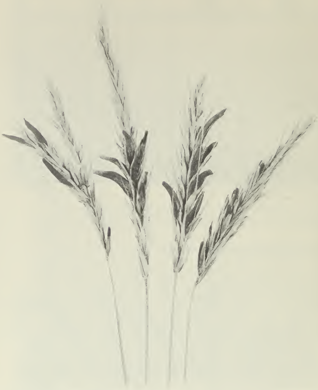
Figure 4. Ergot bodies replacing normal kernels in heads of fall rye.

Leaf rust sometimes attacks rye planted in July, or earlier, so severely that it reduces pasture yields. Although leaf and stem rust occur on rye, they do not usually affect the grain yield of rye seeded in August or September.