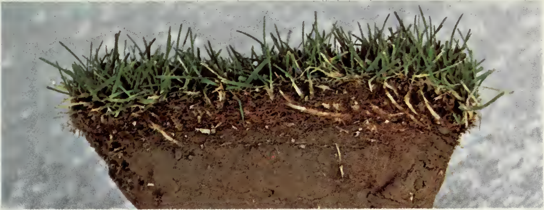
Fig. 9. A layer of thatch on the soil surface.

restricts percolation of water and nutrients and can harbor insects and diseases and cause an unhealthy lawn.