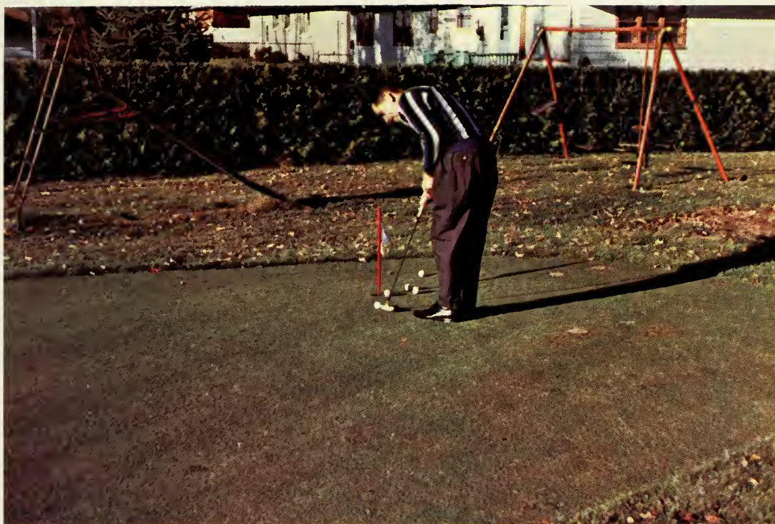
Fig. 14. Bentgrass on a home putting green.

Annual bluegrass, Poa annua , often invades compacted areas of a home lawn but is poor as a lawn species because of its pale green color and unreliability.