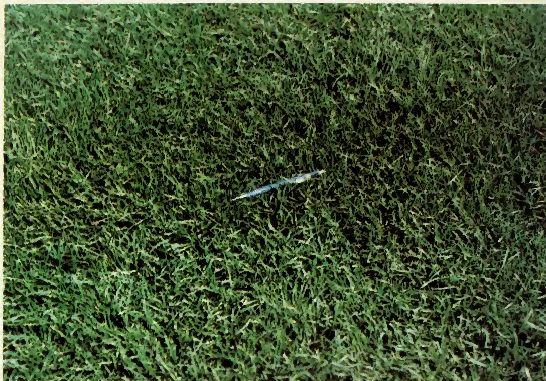
Fig. 13. Improved cultivars in a mixture for home lawns.