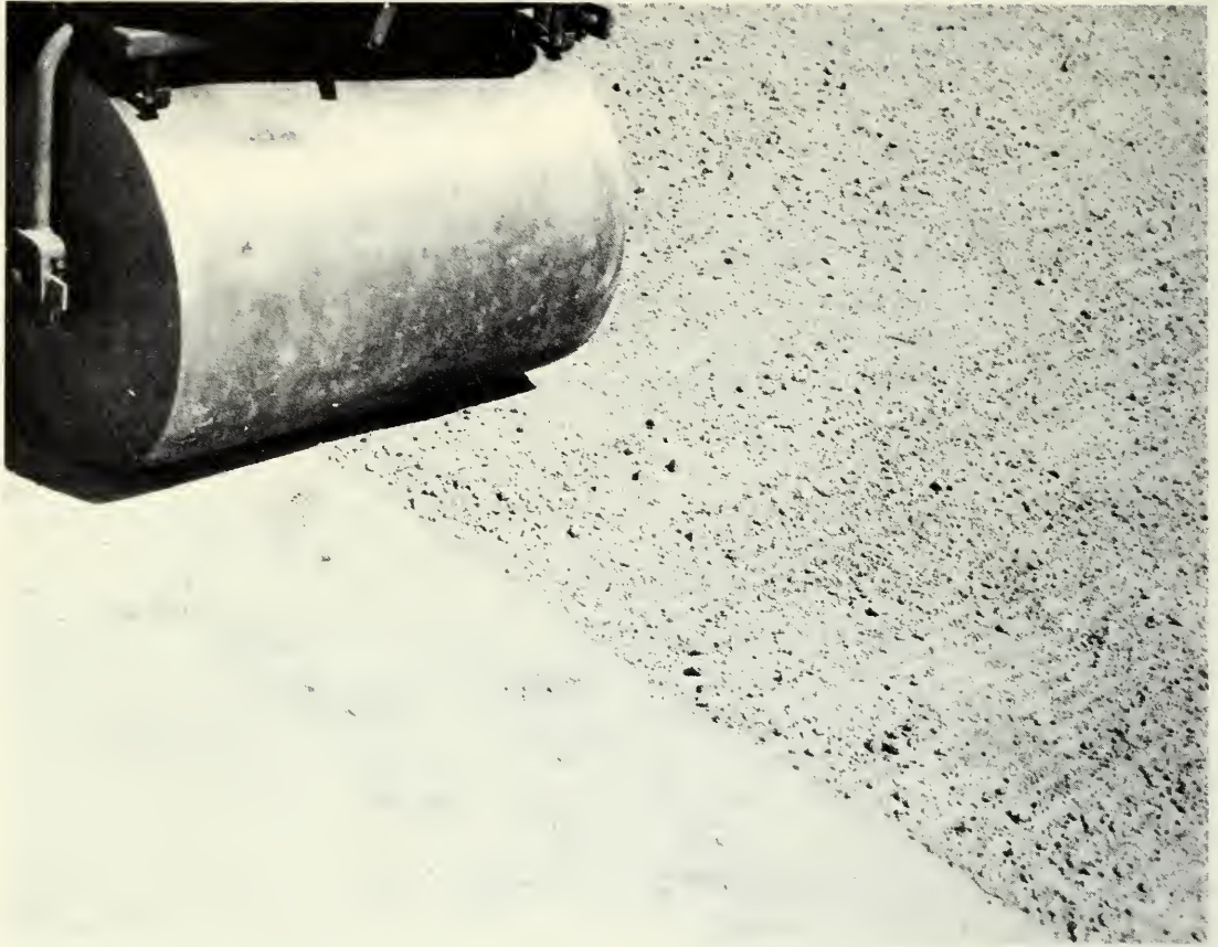
Fig. 3. A seedbed being firmed with a lawn roller.