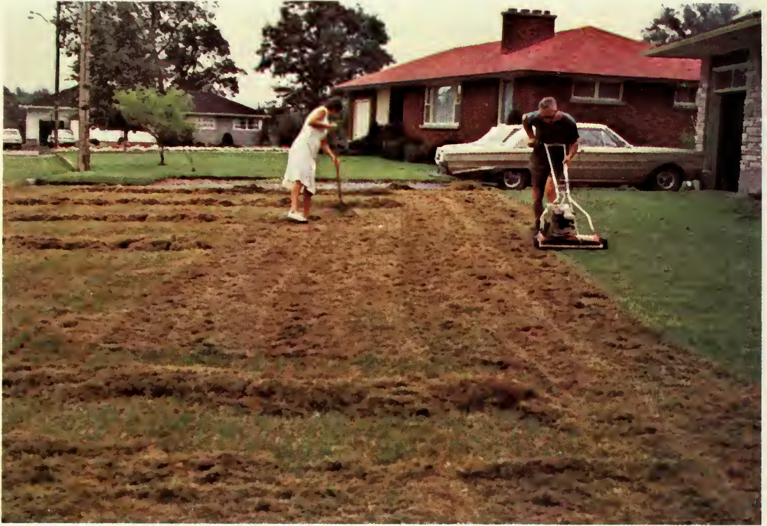
Fig. 10. Dethatching a home lawn.