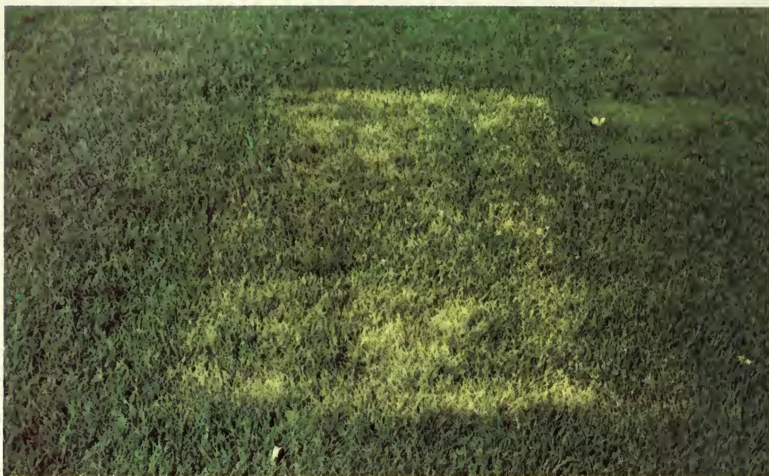
Fig. 7. Turf burning caused by too much nitrogen.

The slow release fertilizers are usually concentrated formulations and therefore smaller amounts are required per unit area. They are the most expensive of the dry fertilizers. High density fertilizers may also be light in weight, which facilitates their application. They contain a soluble fraction, which is readily available after application; the remaining nutrients become available over a period of 3-6 weeks. There is less danger of turf burning than with soluble fertilizers.