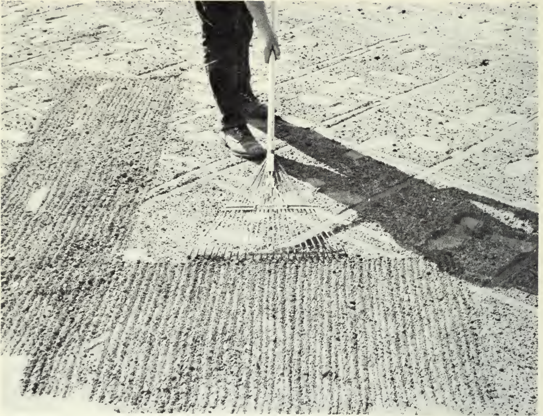
Fig. 5. Covering the seed by means of a fan-shaped rake.