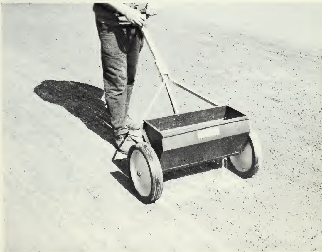
Fig. 2. An auger-driven drop spreader distributing starter fertilizer.

Broadcast enough commercial fertilizer to provide nitrogen at a rate of at least 1 kg/100 m 2 (see fertilizer section and guide). A good starter fertilizer is relatively high in phosphorus (the middle number of the hyphenated numerical grade listed on the package) to encourage rooting. Work the fertilizer into the surface 3 cm by raking with a steel lawn rake. Add lime only when a laboratory soil test shows that it is necessary. Roll the seedbed lightly with a lawn roller. The final seedbed should be granular yet firm, slightly moist, and on the desired grade.