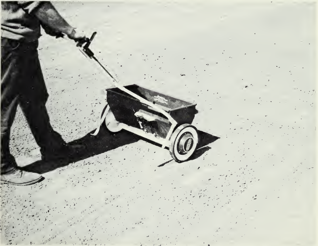
Fig. 4. Sowing seed with a drop seeder.

Seed at the rate of 1.5–2.5 kg/100 m 2 as recommended in the guide. For even coverage, sow half the seed on the whole area in one direction and the rest at right angles to the first. Small areas can be seeded by hand. For larger areas use an accurate, calibrated broadcast or drop seeder, which has directions to indicate the settings for various seeding rates. A seeder can usually be rented from a garden center, seed store, or household equipment rental agency. Cover the seed lightly with soil by means of a fan-shaped rake and roll the seeded area lightly.