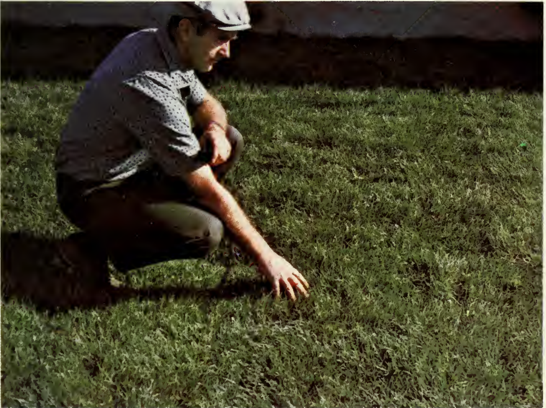
Fig. 6. A newly sodded lawn.

Use only seeded nursery sod; pasture sod usually contains coarse, undesirable grasses. Prepare the soil as for seeding. If unlaied sod is to be held for more than 8 hours, stack it in the shade or cover it with moist burlap. Lay the first row of sod close together without crowding in a straight line along a curb, driveway, or taut string. Indent the second row from the first like brickwork so that the ends alternate. Sod pieces can be cut to fit nonrectangular places by means of a sharp lawn edger, knife, or hatchet. Stake the sod laid on steep slopes. When all the sod has been laid, roll it with a lawn roller partly filled with water to ensure contact of the roots with the soil. Water thoroughly and do not allow the sod to dry out.