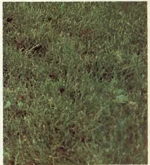
Fig. 12. A lawn before and after treatment with a herbicide.