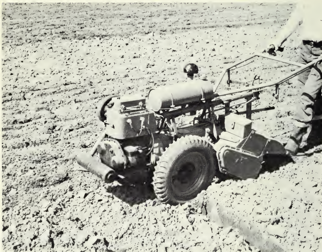
Fig. 1. A rotary tiller being used to prepare the soil for seeding.

Wet, heavy clay soils and dry sandy soils are not suitable for growing turf. However, they can be modified to make a suitable topsoil. Spread 5 cm of washed sand over the surface of a clay soil and mix it thoroughly with the surface 8 cm of soil with a rotary tiller or by hand digging. This will greatly improve the texture, drainage, and aeration. Similarly the tilth and water-holding capacity of a sandy soil can be improved by adding clay. The chemical limitations can be enhanced by thoroughly incorporating a 5 cm layer of farm manure, spent mushroom spoil, or granulated peat moss into the soil surface.