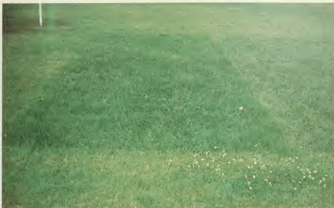
Fig. 8. Response to fertilizer.

the drop spreader. The hand-held broadcast spreader is useful and light and gives good coverage. With all spreaders be careful to avoid overlapping or leaving unfertilized strips. If the spreader is run back and forth parallel to the street, such errors are not so noticeable. Carefully set any spreader at the correct application rate. After use wash the spreader thoroughly because fertilizers are corrosive. A spreader can usually be rented from a garden center, fertilizer dealer, or household appliance rental agency.