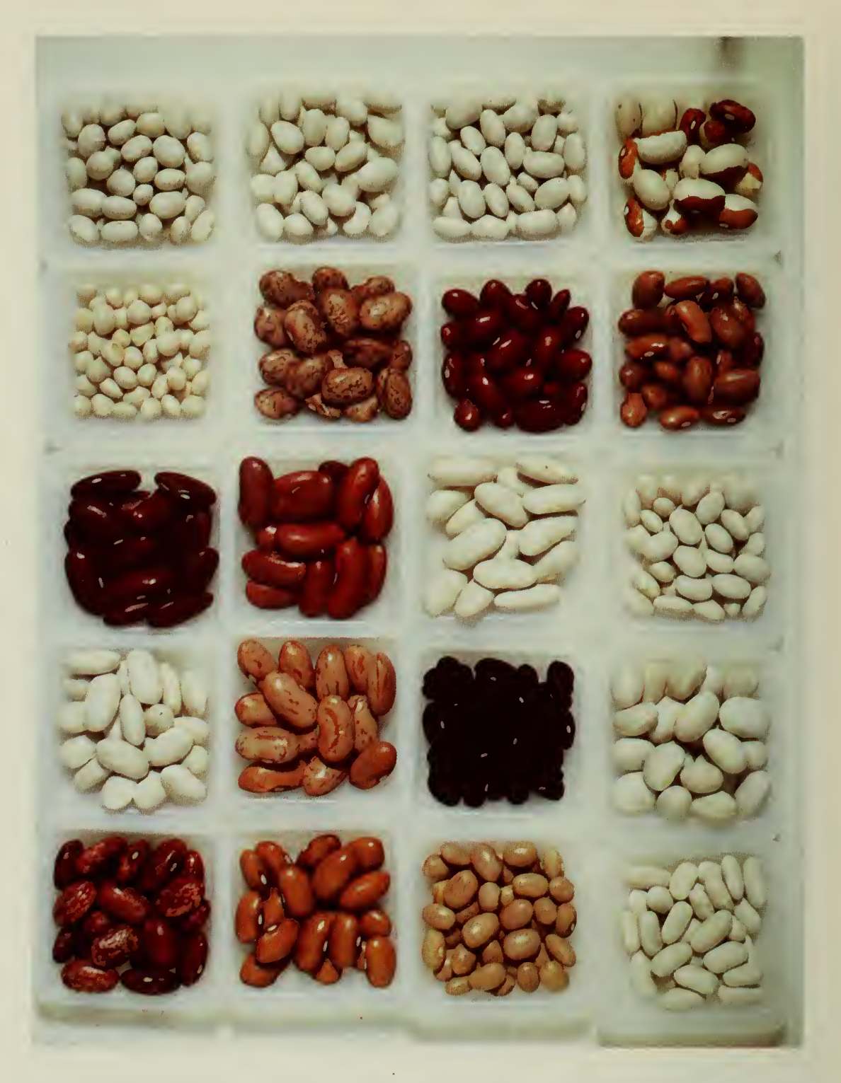
Fig. 1. Field beans are classified into various types (market classes), based on size, shape, and shade and pattern of color of beans. From left to right: Top row: OAC Seaforth, Harokent, Harofleet, Steuben yellow eye Second row: small white pea bean, pinto, red Mexican, pink Third row: dark red kidney, light red kidney, white kidney, small white Fourth row: great northern, cranberry, black, white marrow Fifth row: Jacob's cattle, brown, light brown, snap bean type