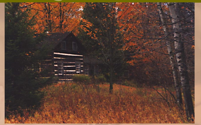
Canadian Wildlife Service