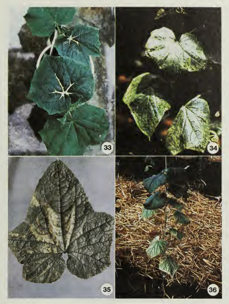
Fig. 33 Injury caused by an overdose of etridiazole, an illegal chemical in Canada. The veins are white and the plant is stunted.

Fig. 34 A mistake in measuring the dose of thiodan resulted in leaf yellowing and severe damage to the growing point.