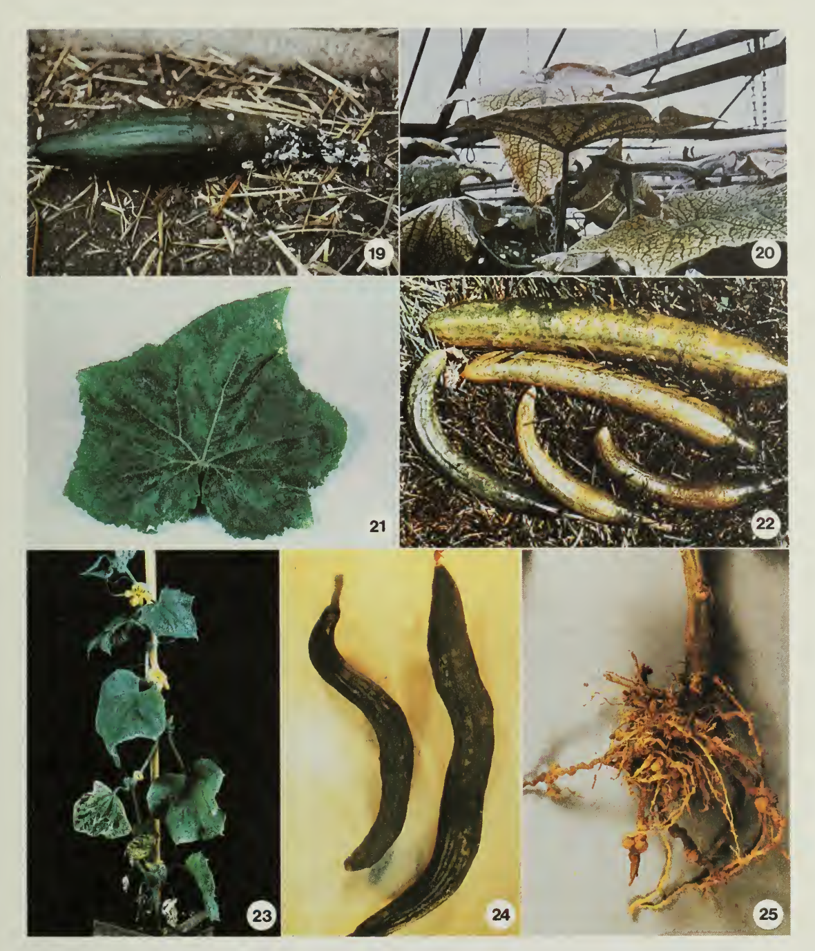
Fig. 19 White mold on a cucumber fruit is characterized by prolific white fungal growth and by large, resistant sclerotia.

Fig. 20 Beet pseudo-yellows virus. The leaves are finely mottled with yellow.