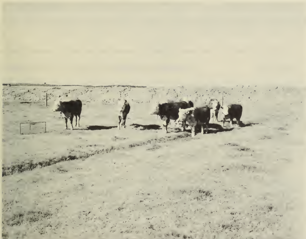
Figure 2 – Steers grazing on a dikeland field that received annual applications of limestone and superphosphate. Dike in the background is being repaired. 1959.