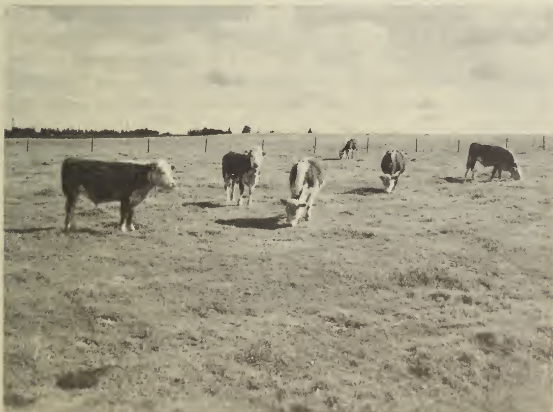
Figure 3 – Steers grazing on an upland field that received annual applications of limestone and superphosphate. 1959.