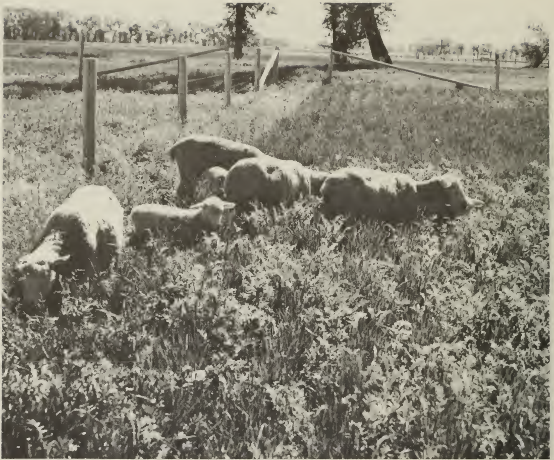
Fig. 3 Sheep grazing 3-year-old stand of sainfoin and crested wheatgrass.