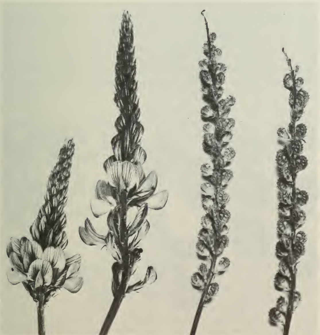
Fig.1 Left , sainfoin heads in flower; right , fully ripened seed.

Most cultivated sainfoins (Fig. 1) are identified as Onobrychis viciifolia Scop. At least two other species are grown in the USSR and China, but they are not readily distinguishable from O. viciifolia .