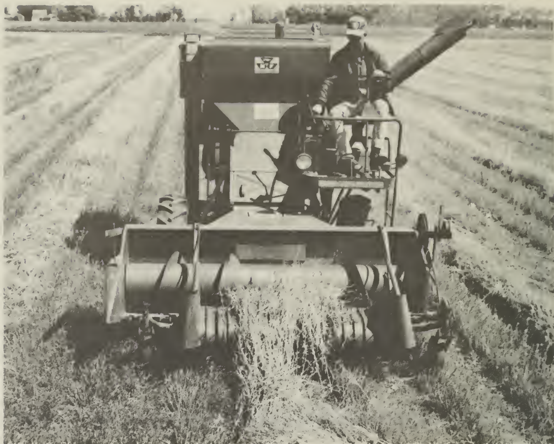
Fig. 5 Picking up the swathed seed crop.

Unless the combine is equipped with a chopper, remove heavy crops of stems (straw) from seed fields after combining because such residue may smother subsequent regrowth of sainfoin.