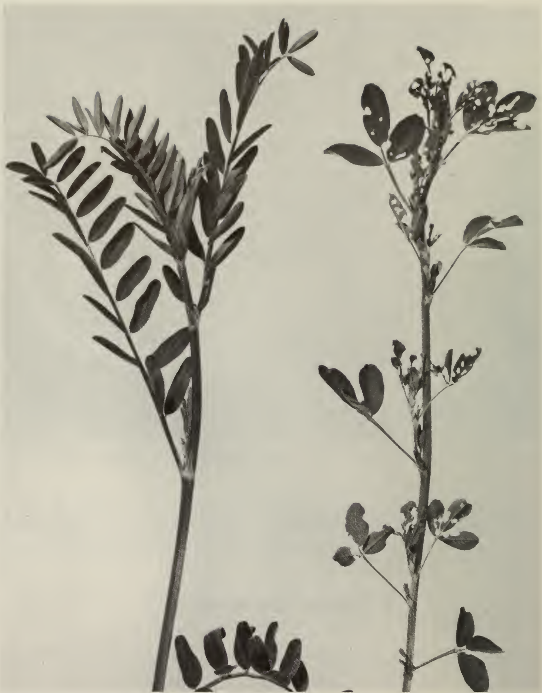
Fig. 6 Left , sainfoin is immune to attack by the alfalfa weevil; right , upper leaves of alfalfa show damage from feeding by weevil larvae.