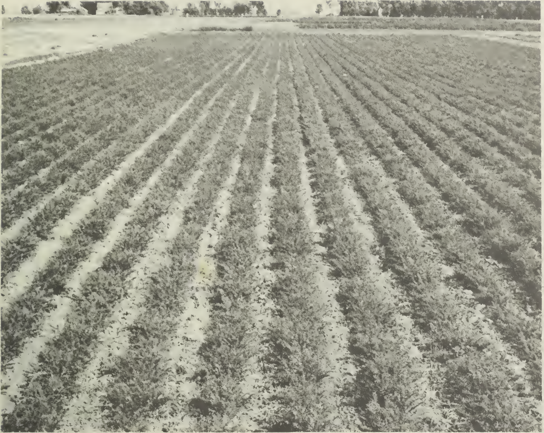
Fig. 4 Sainfoin in rows spaced 60 cm apart for seed production. Weeds have been controlled by cultivation.

usually do not produce sufficient seed in the 1st year to be worth harvesting. For maximum yields in subsequent years, harvest the seed from the first growth.