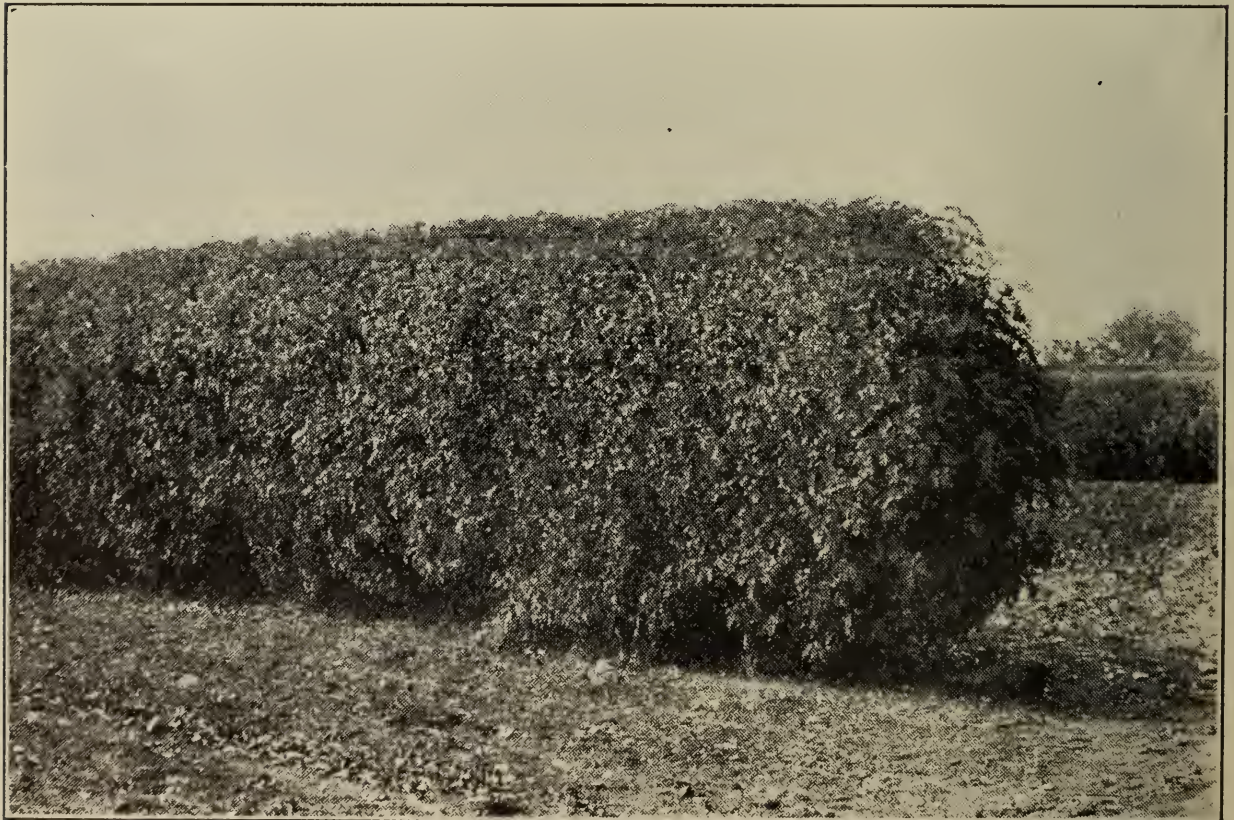
Caragana hedge, about seven years old, grown from seed. The hedge, which is about five feet high, is trimmed every year.

COLLECTING SEED. —Caragana seed is produced abundantly on plants over four years old. The pods should be picked as soon as the seed has become well filled and is turning a dark colour. The pods should be spread out in a warm, dry place and frequently stirred. As the pods dry they split open and the seed is thrown out. The seed should then be put through hand sieves or run through the ordinary grain fanning mill to separate the pods, leaves, etc. The seed should then be bagged and stored in a dry place. If kept dry, it will retain its vitality for three and sometimes four years.