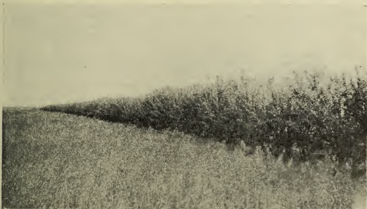
Caragana field shelter, about six years old. This hedge is a mile long and about six feet high. Since it was from four feet high it has materially affected the yield of grain in this field, and on one occasion since (in 1931) it saved the field from a total loss.

There are several species of caragana hardy in the West, but the one commonly found and used very widely for hedge purposes is the Caragana arborescens , introduced from Siberia. Though it cannot be classed as a tree, the caragana is so hardy and vigorous, and adapts itself to such varied conditions of soils that it must be considered as a most valuable plant for shelter purposes. When left to grow naturally it will attain a height of 18 to 20 feet.