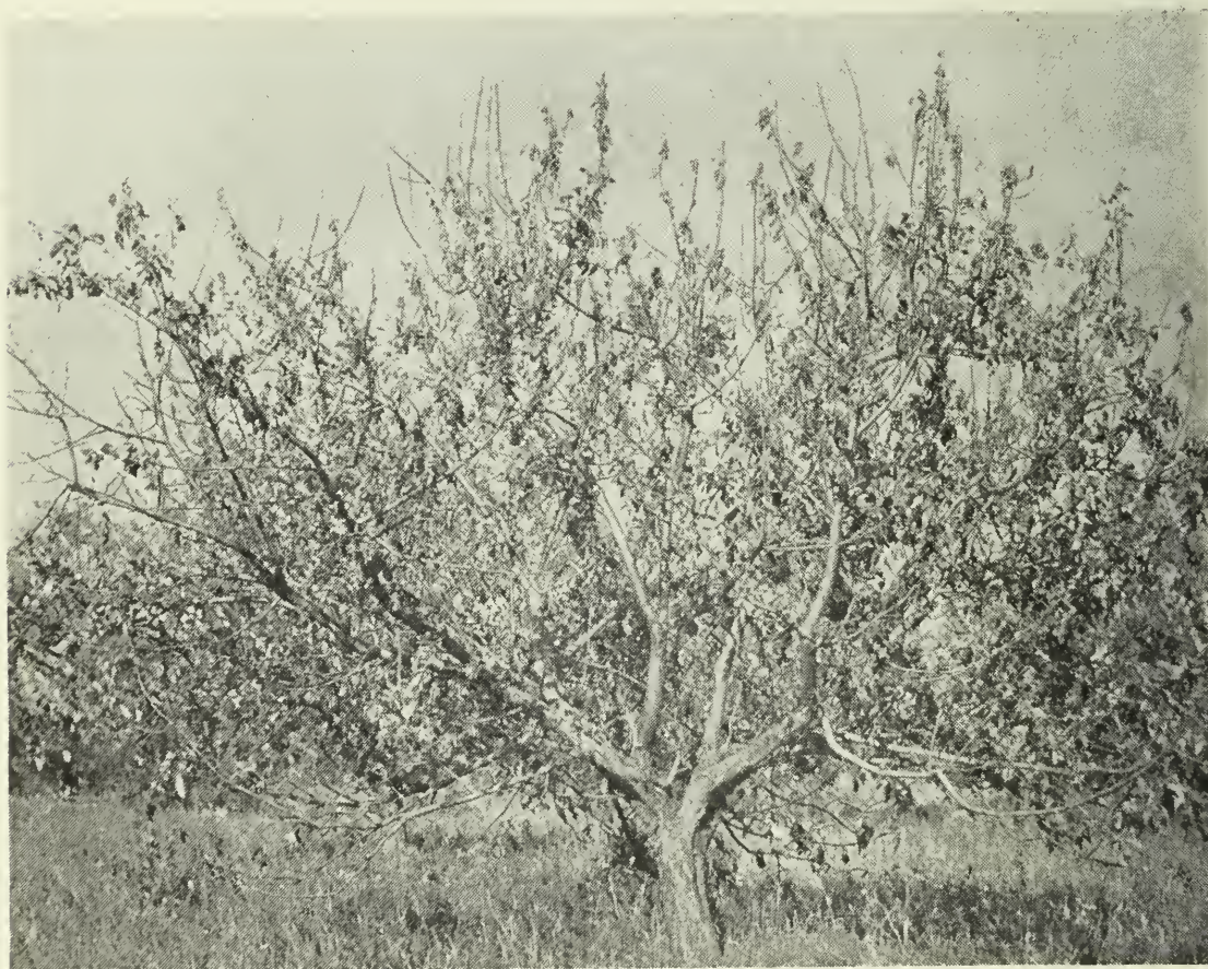
Severely blighted Alexander apple tree. The newly blighted shoots have dark, shrivelled leaves and drooping tips. The leafless twigs were killed the previous year.

The only reliable means of control known so far is the cutting out and burning of all diseased material. If the trees are not badly affected, this should be done as promptly as possible after the infections appear, and preferably before rain. If the trees are severely affected, the pruning should be delayed until the fall or winter, when the trees are in a dormant state, except sprouts and water shoots, which should be removed periodically throughout the season, in order to prevent the disease reaching the main branches, trunks, and roots. Heavy pruning during the summer will prolong vegetative growth. The new growth may not ripen sufficiently before the cold weather and the trees may suffer from winter injury. Also the longer the trees are kept in a growing condition, the longer are they susceptible to infection by fire-blight. Care should be exercised not to cause unnecessary wounds to the trees by shoes, ladders, cultivating tools, scythes, etc., while pruning, picking, or cutting down weeds or cover crops.