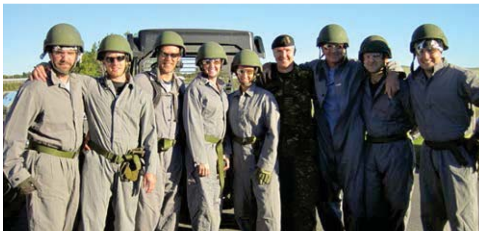
DCC Kingston helped support DND's United Way campaign by entering a team in the Commando Challenge on September 15, 2012.