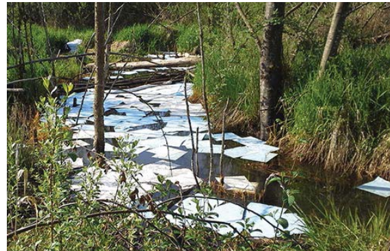
Spill pads are laid to contain the spread of fuel in the water