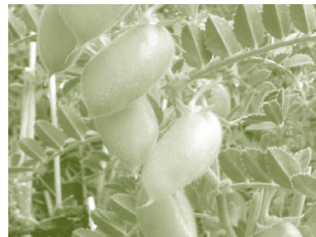
Scientists at the Crop Development Centre are developing chickpea varieties with increased disease resistance and earlier maturity.

"One of the projects is to look at what we call the plant architecture, to see