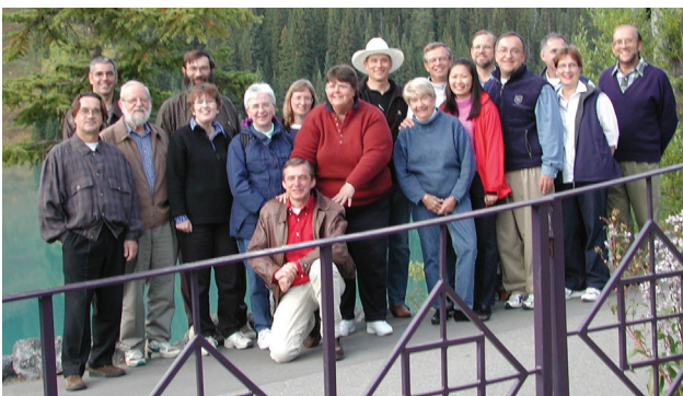
Inaugural IAB Retreat, 2001.