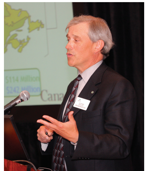
IAB Open Forum, Halifax, 2006.