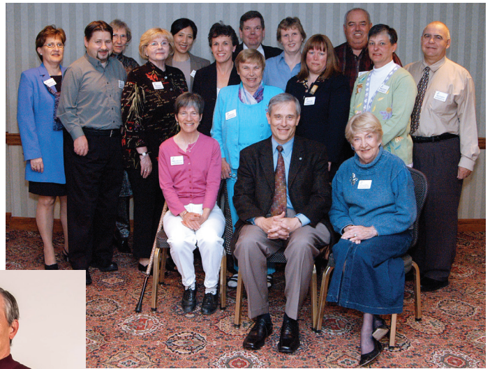
Knowledge Exchange Task Force (KETF) members, 2005.