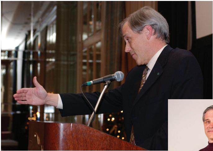
Osteoarthritis New Emerging Teams (OA NETs) announcement.

"A thousand words will not leave so deep an impression as one deed." - Henrik Ibsen