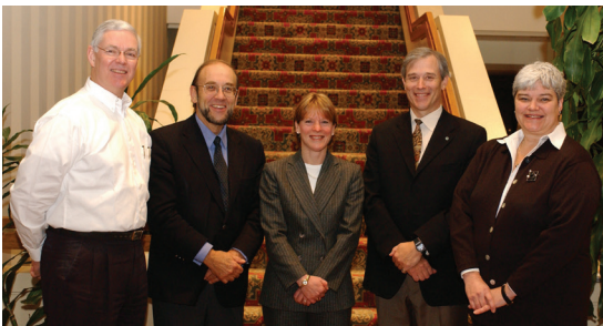
Osteoarthritis New Emerging Teams (OA NETs) announcement.