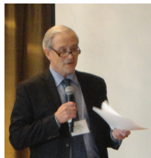
Addressing IMHA stakeholders at the strategic planning brainstorming session in Vancouver, March, 2014.