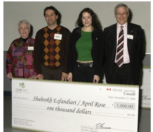
Poster Prize presentation: On the Move, Calgary, 2006.