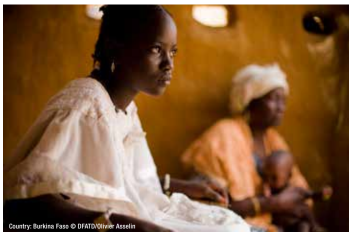
Country: Burkina Faso

On December 18, 2014, the UN General Assembly adopted by consensus a resolution led by Canada and Zambia, with 116 co-sponsors, on child, early and forced marriage, reaffirming the need to protect young girls, and secure their futures.