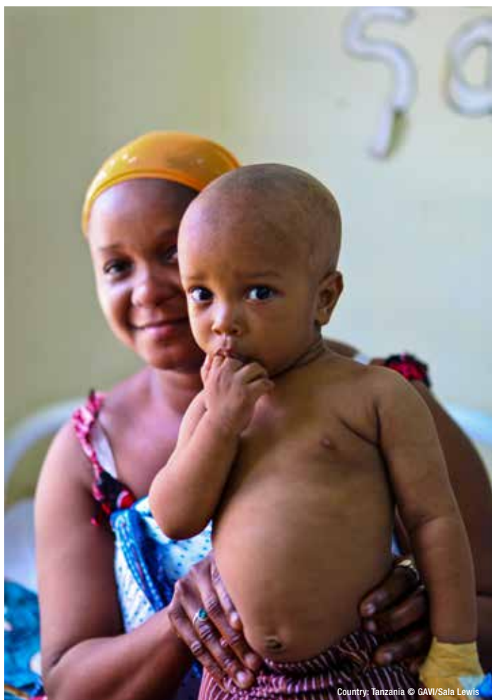
Country: Tanzania

The goal of the Global Financing Facility is to accelerate efforts to end preventable newborn, child, adolescent and maternal deaths and improve the health and quality of life of women, adolescents and children. The GFF will focus on strengthening national-level systems to collect the data development planners and businesses need to design effective programs and services in health, education and economic growth, and could prevent up to 3.8 million maternal deaths, 101 million child deaths and 21 million stillbirths in 63 high-burden countries by 2030. The Global Financing Facility will include specific support for civil registration and vital statistics systems in developing countries, to which $100 million of Canada's total contribution will be dedicated.