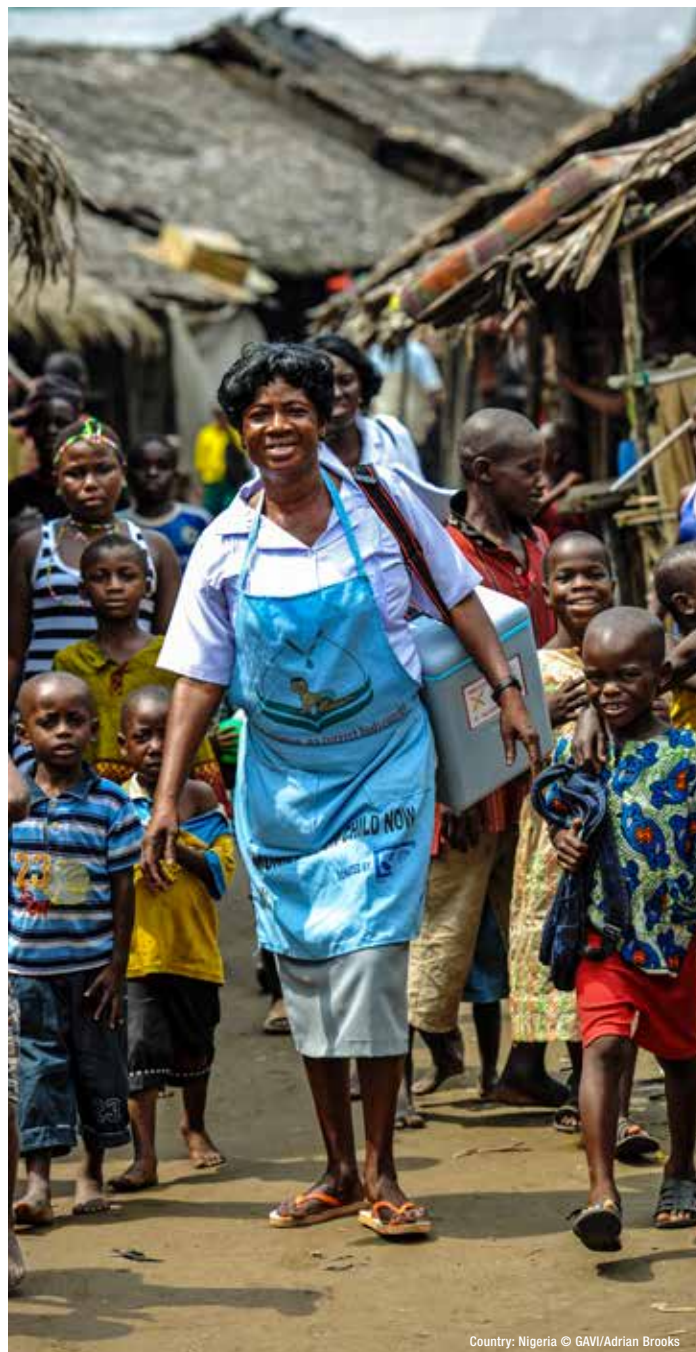
Country: Nigeria