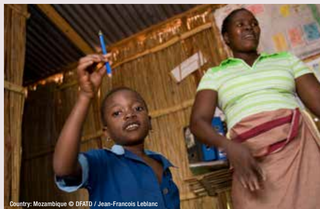
Country: Mozambique

In Mozambique, some of the most important health issues—diarrhea, cholera and malaria—often come from poor sanitation. According to Mozambique's Ministry of Health, when clean water and proper sanitation services are available, there is a 30 percent drop in illnesses. The Canadian project is addressing this issue by encouraging behavioural changes and by strengthening the capacity of Inhambane province to provide gender-sensitive water and sanitation services. The results so far are encouraging: as a consequence of PASARI activities, 66 communities and 74 schools are now using sanitation systems. By building proper water and sanitation facilities in schools, Canada helps children attend school and build a future for themselves.