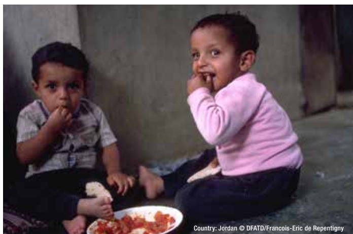
Country: Jordan

soybean processing plant, and improve their knowledge about nutrition, including on new soy-based products such as milk, tofu and yogurt. Additionally, in South Sudan, a total of 58,920 households were employed in the DFATD-funded World Food Programme's food-for-work and cash-for-work activities (75 percent of those employed were women). These activities resulted in the construction and rehabilitation of 361 km of community roads, the production of 2.5 million seedlings, and the clearing and conversion of 15,121 ha for cereal farming. These activities benefited 412,000 rural poor.