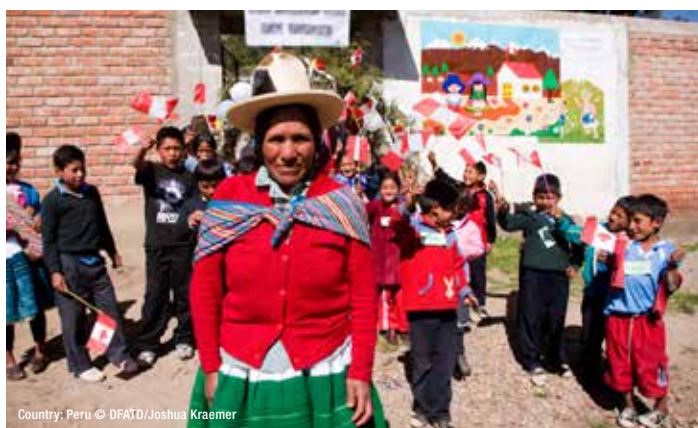
Country: Peru

In 2014–2015, Canada provided $20 million in funding to UNICEF to end CEFM in six countries where Canada supported the development of the CEFM policy and legislative frameworks and a budgeted national action plan for the elimination of child marriage. In addition, Canada's efforts have helped pave the way for several improvements on the draft amendment to Bangladesh's Child Marriage Restraint Act (1929), such as the issue of accountability in the verification of the marriageable age and penalty for falsifying the proof of marriageable age.