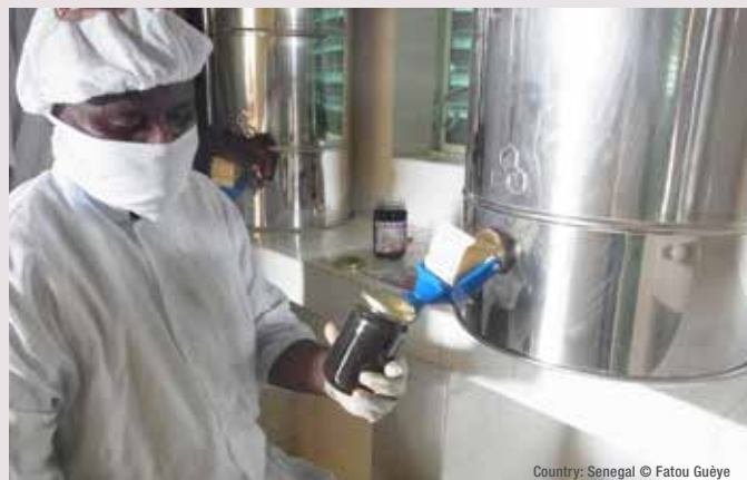
Country: Senegal

While their production quintupled in less than 10 years—from 1,463 kg in 2004 to 7,961 kg in 2013—and their revenue increased sevenfold over the same period—from 1.4 million CFA francs (approximately $3,000) to 9.8 million CFA francs ($21,000)—their journey was not an easy one, even though they benefited from constant support from the Government of Canada in Senegal!