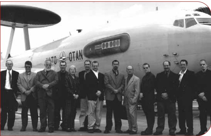
Participants and organizers of the 2003 SDF trip to NATO see an AWACS aircraft up close during their visit to Geilenkirchen Air Base in Germany.

The 2003-2004 program year has already started off well. In June, 12 representatives from