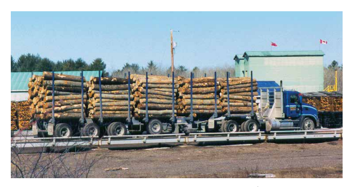
Truck loaded with logs on a weigh scale. The volume of logs is calculated from the weight of the load on the truck.

For information on how Canada prevents imports of illegally harvested forest products, see www.cfs.nrcan.gc.ca/illegallogging.