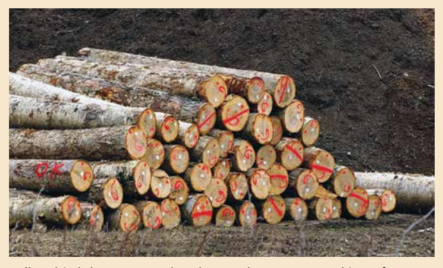
Yellow birch logs stamped and tagged to ensure tracking of valuable logs throughout the process from woods to mill to product.