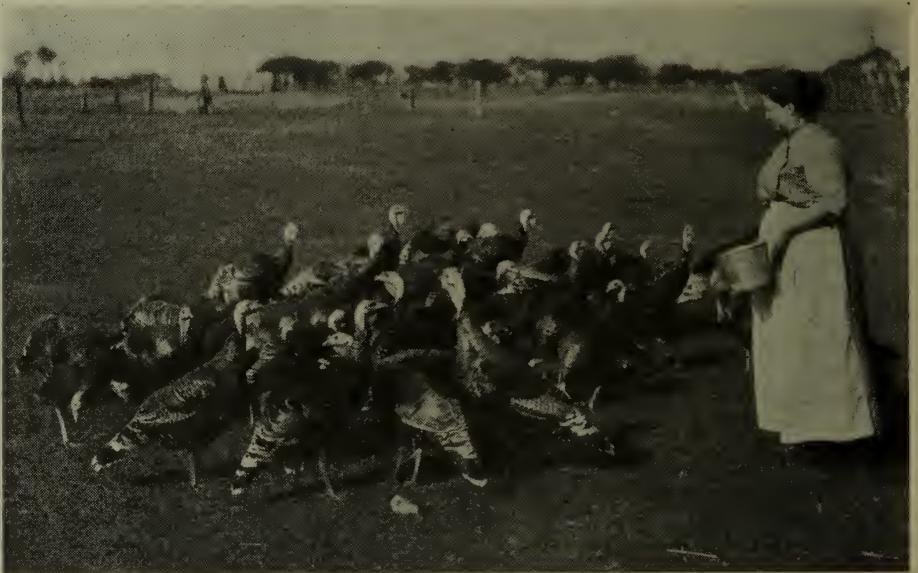
Turkeys on free range.

Where dry mash hoppers are used, or where poults are fed from self-feeding hoppers, the hopper should be moved from place to place regularly so that the ground in the immediate vicinity of the feeding hopper will not become contaminated with droppings, as the birds will possibly stand around after they get their supply of feed. Moving the hopper from place to place every three or four days will allow the sun's rays to clean up the ground around where the hopper has been previously located, and thus enable the breeder to offset the possibility of infection or contamination from this source.