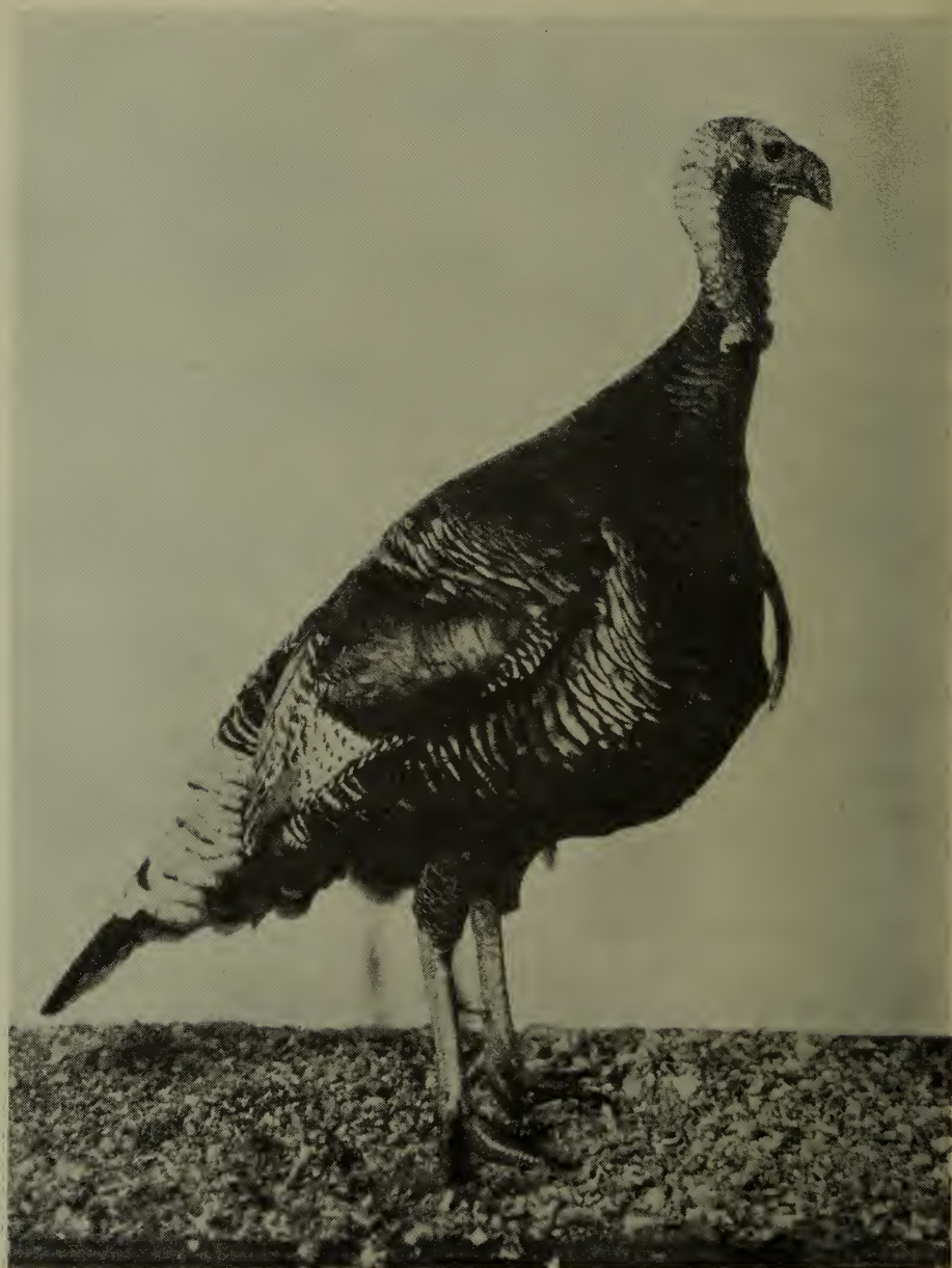
First prize Bronze turkey cock. Ottawa Winter Fair.