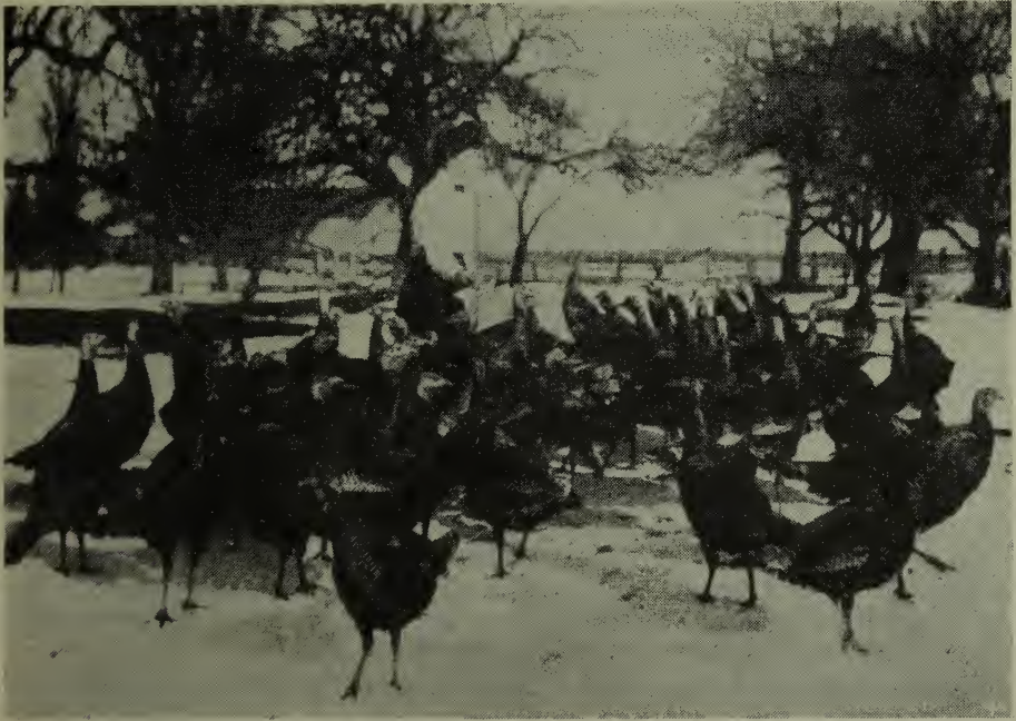
Bronze turkeys at fattening time.

When the time arrives for fattening, the young birds should be started feeding gradually. The proper time to commence is four weeks before they are wanted for table use. Three weeks of this time goes towards conditioning the birds, and the fourth week for killing, shipping and retailing to the consumer. The feed should be composed both of mashes and whole grain. Feed mashes morning and mid-day, and the whole grain for the evening meal; and as the former are more easily digested than whole grains, the birds can assimilate larger quantities of feed when given in that form. The reason for feeding whole grain in the evening is to prevent the birds becoming very hungry before morning, which would surely happen if mash were the evening meal.