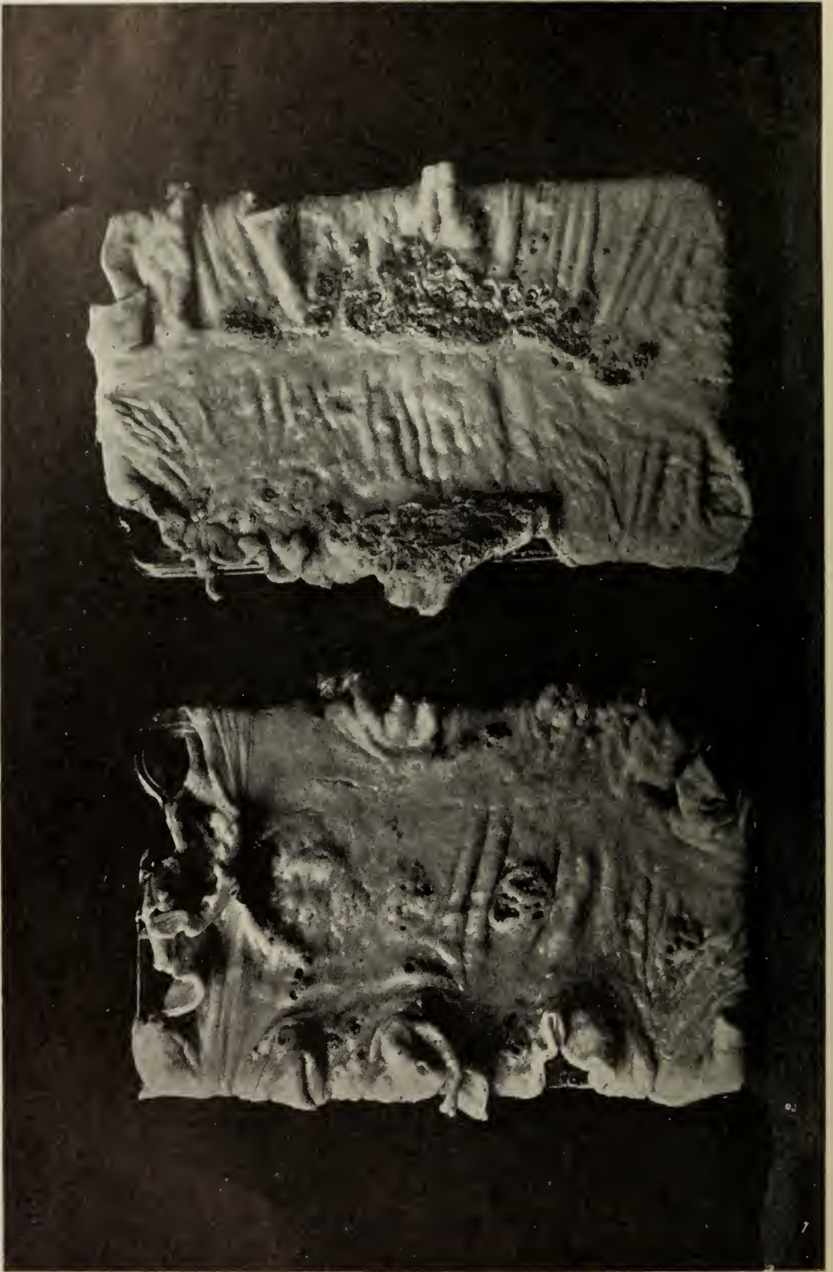
HOG CHOLERA. (LESIONS BELOW THE ILEO-CAECAL VALVE OFTEN ASSOCIATED WITH HOG CHOLERA.)