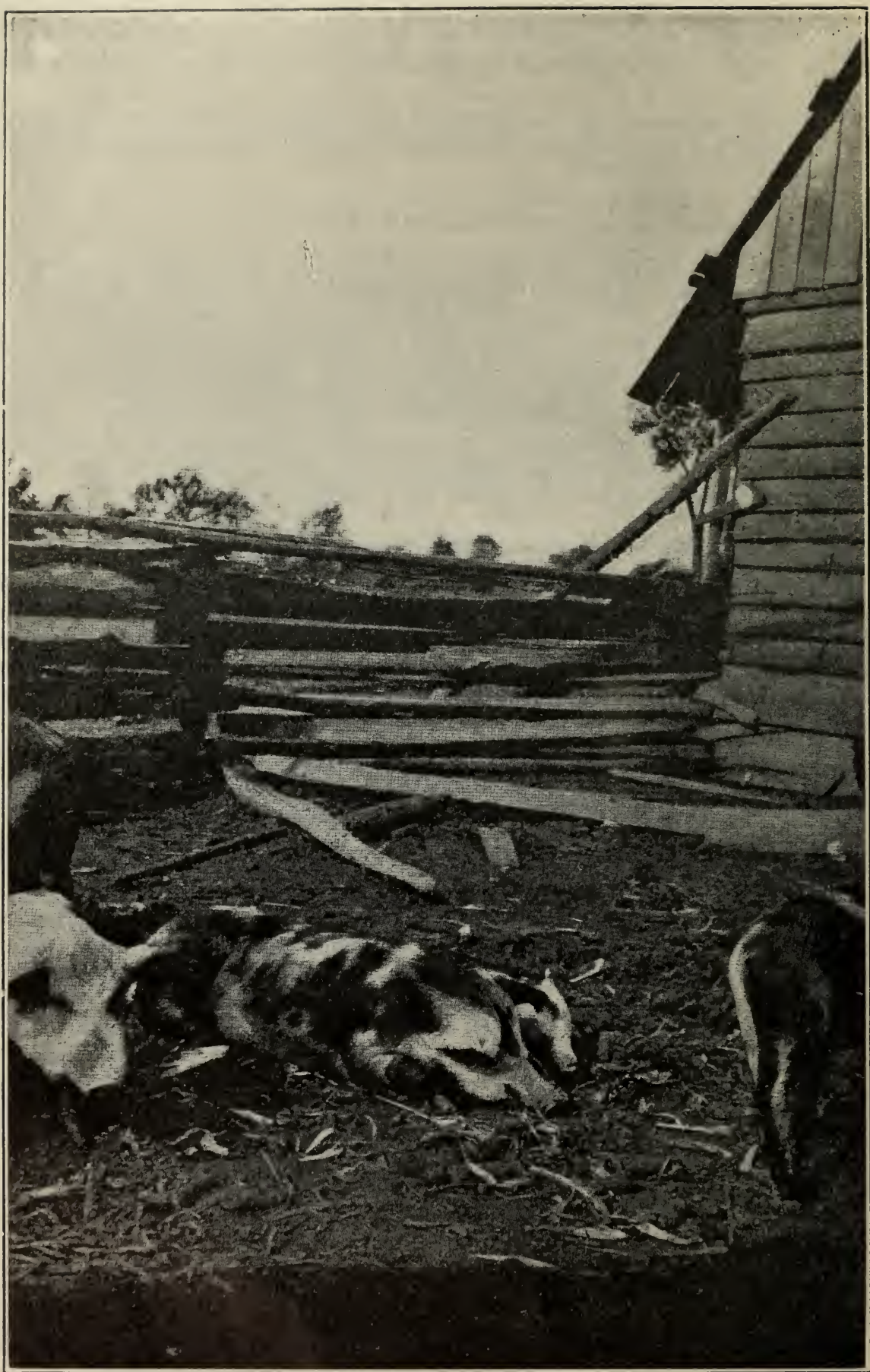
HOG CHOLERA—CHARACTERISTIC ATTITUDES