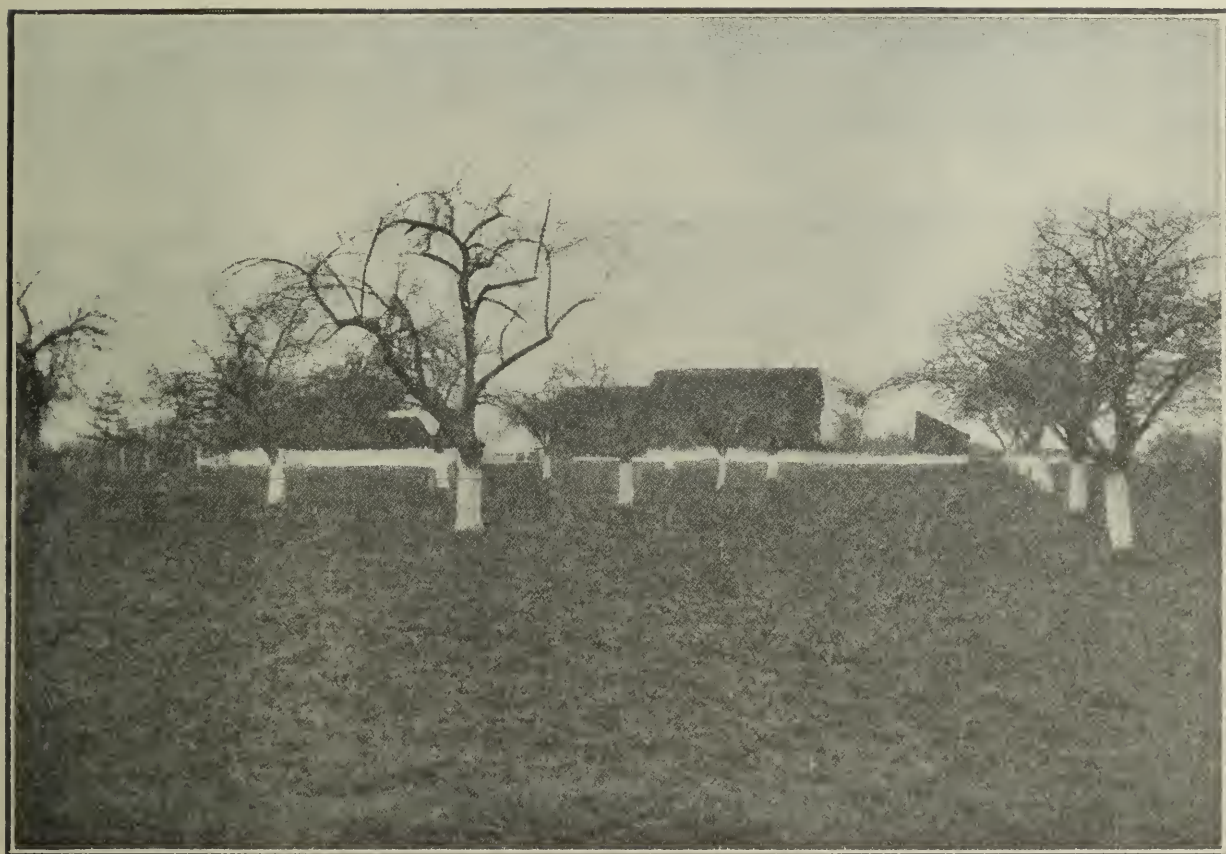
DISINFECTION OF PREMISES. NOTE PLOUGHED GROUND, WHITEWASHED TREES AND FENCES.