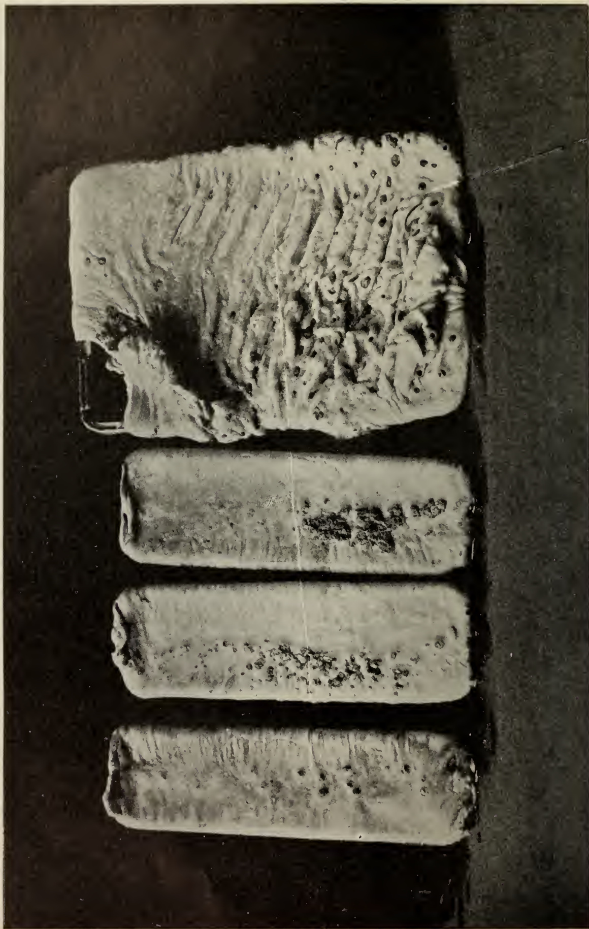
Hog Cholera. (Ulcers of the intestine often associated with hog cholera. The narrower portions are small intestines near their junction with the large bowel. The large portion includes the valve and a portion of the large intestine.)