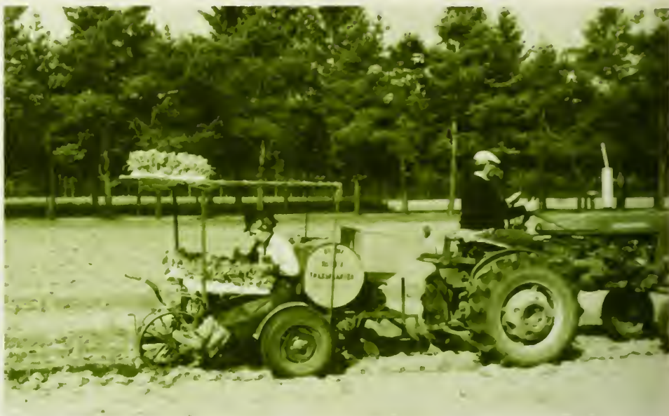
top right 1978 Holland transplanter with Mary Soen planting container-grown seedlings and Mike Soot driving. Some growers now produce seedlings in containers