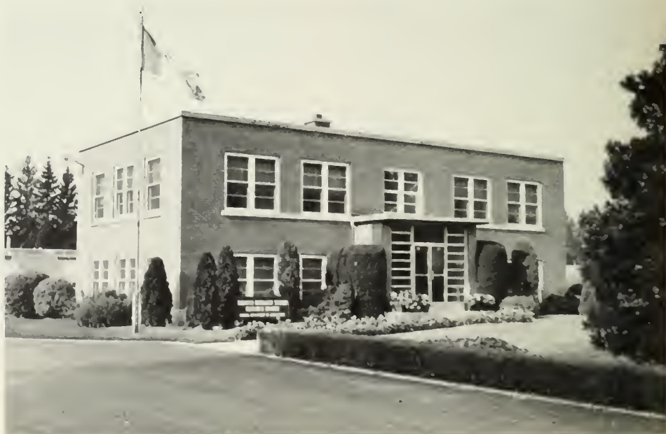
Front view of office building opened in 1953