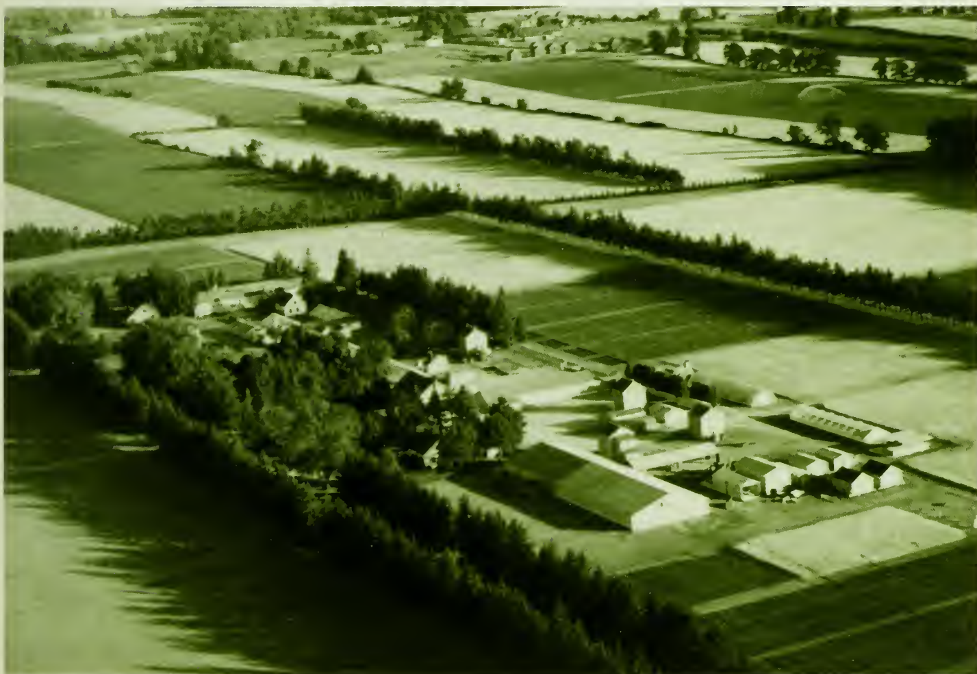
Aerial view of Delhi Research Station