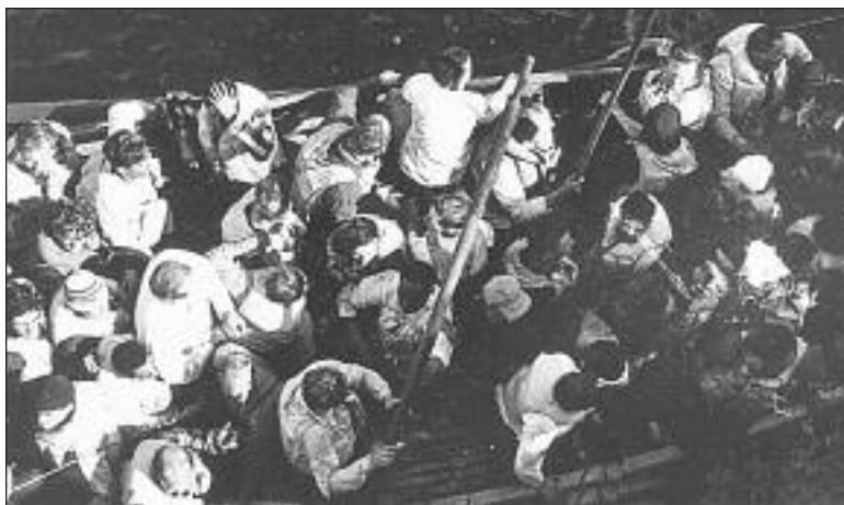
SURVIVORS OF CHATHAM , THE FIRST AMERICAN TROOP TRANSPORT TO BE LOST DURING THE WAR, BEING RESCUED BY THE CREW OF HMCS TRAIL IN THE STRAIT OF BELLE ISLE ON AUGUST 27, 1942. (LAC, PA-200331)

freighter chartered to the British Ministry of War Transport, off Rivière-la-Madeleine. Six merchant seaman died in the first attack and a dozen in the second.