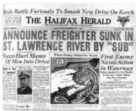
HALIFAX HERALD, MAY 13, 1942.

The Battle of the Gulf of St. Lawrence, which saw German U-boats penetrate the Cabot Strait and the Strait of Belle Isle to sink 23 ships between 1942 and 1944, marked the only time since the War of 1812 that enemy warships inflicted death within Canada's inland waters. The battle advanced to within 300 kilometres of Québec City. A war that pervaded people's lives but was still somehow remote, had become