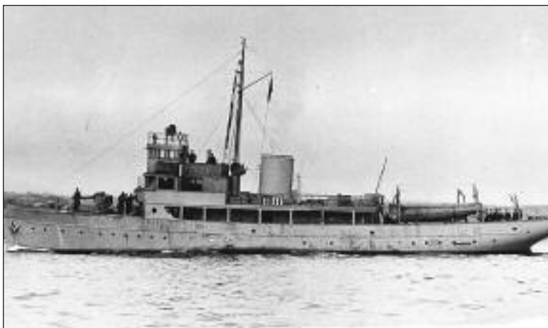
THE ARMED YACHT HMCS RACCOON (BEAM VIEW) WAS SUNK DURING THE NIGHT OF SEPTEMBER 6-7, 1942. WEEKS LATER A FEW BITS OF WRECKAGE WASHED UP ON SHORE. (DND, 2784)

The next day the U-boat duo struck at SG-6 again. U-165 torpedoed the merchant ship Laramie , while U-517 attacked the US-registered Arlyn . The Laramie survived to limp back to Sydney, Nova Scotia, but Arlyn and nine of her crew found their last resting places deep in the Strait of Belle Isle.