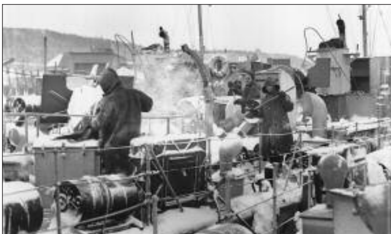
FAIRMILES OF THE 82 ND FLOTILLA STOP OFF AT GASPÉ AFTER BUFFETING WINTER STORMS ON THE WAY DOWN THE ST. LAWRENCE TO HALIFAX.