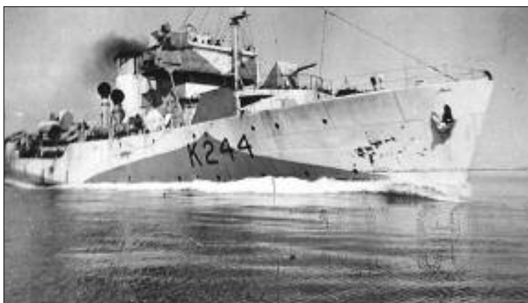
ON SEPTEMBER 11, 1942, HMCS CHARLOTTETOWN (I) WAS DESTROYED WITHIN SIGHT OF HORRIFIED ONLOOKERS ON THE SHORES NEAR CAP-CHAT.

shipping, with its excellent access to Canada's industrial heartland, was a serious threat.