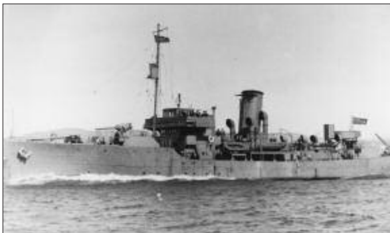
THE CORVETTE HMCS SHAWINIGAN, A VETERAN OF THE ST. LAWRENCE CONVOY BATTLES.