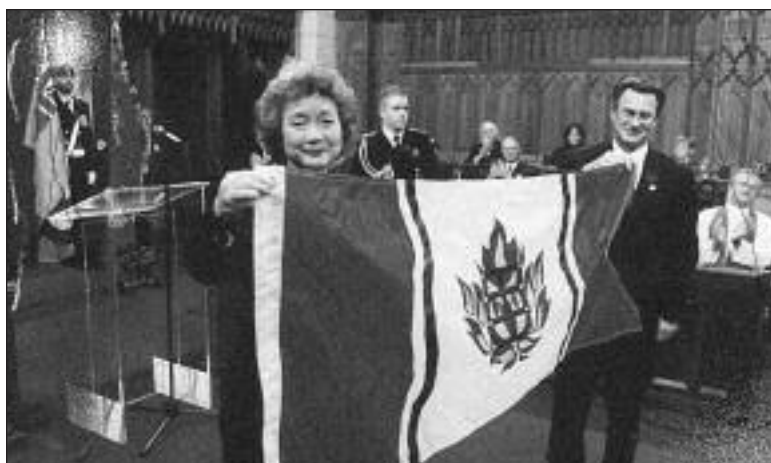
GOVERNOR GENERAL ADRIENNE CLARKSON (LEFT) AND GEORGE BAKER, THE MINISTER OF VETERANS AFFAIRS (RIGHT), DISPLAY THE NEW GULF OF ST. LAWRENCE COMMEMORATIVE DISTINCTION PENNANT DURING CEREMONIES IN THE SENATE CHAMBER. (NOVEMBER 1999)

Many of those whose lives were claimed by the Battle of the Gulf of St. Lawrence have no known grave. Their lives, and their sacrifices, are commemorated on Commonwealth War Graves Commission memorials on both sides of the Atlantic. Those members of the Royal Canadian Navy, the Canadian Army and the Canadian and Newfoundland Merchant Marine whose grave is the sea, are commemorated on the Halifax Memorial. Members of the Royal Canadian Air Force who lost their lives in the Gulf theatre and whose last resting place is unknown, are commemorated on the Commonwealth Air Forces Ottawa Memorial. The names of Royal Navy personnel whose lives were claimed by the waters of the Gulf, are inscribed on the Plymouth Naval Memorial or the Lowestoft Naval Memorial in the United Kingdom.