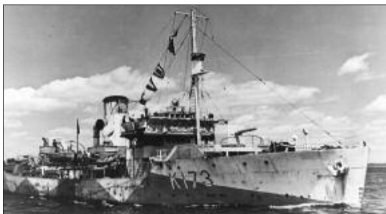
THE HMCS WEYBURN. (DND, NP-1012)