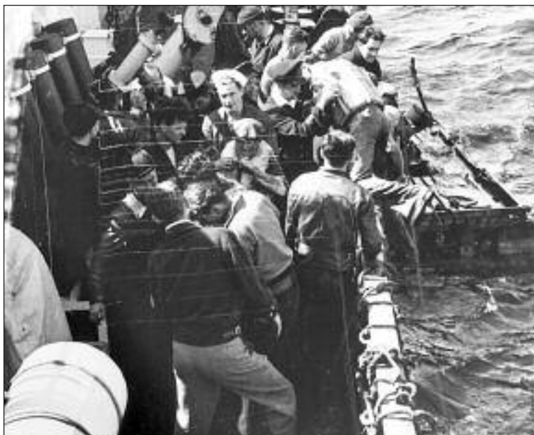
WHEN THE CHATHAM WAS SUNK ON AUGUST 27, 1942, OF THE 562 PASSENGERS AND CREW MEMBERS, ALL BUT 13 WERE SAVED BY THE CREW OF THE HMCS TRAIL, RCAF AIRCRAFT AND US COAST GUARD ESCORTS.