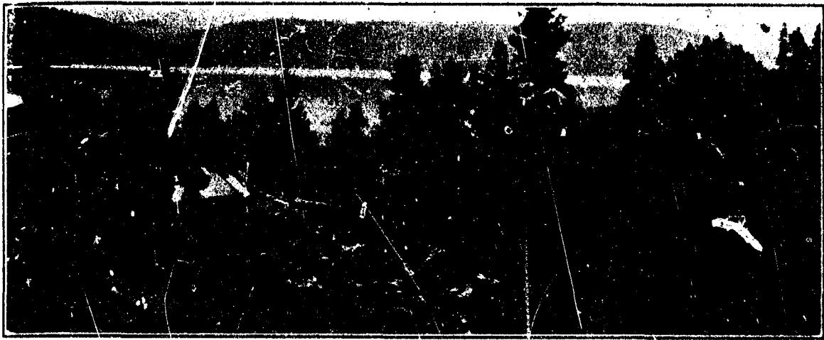
LONG LAKE RESERVE