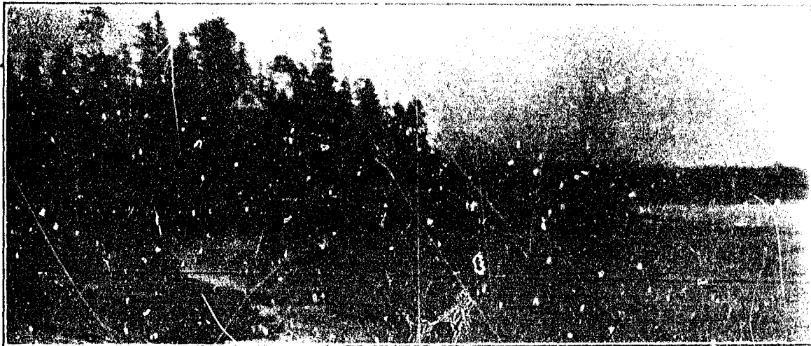
CLA-OOSE RESERVE AND SCHOOL