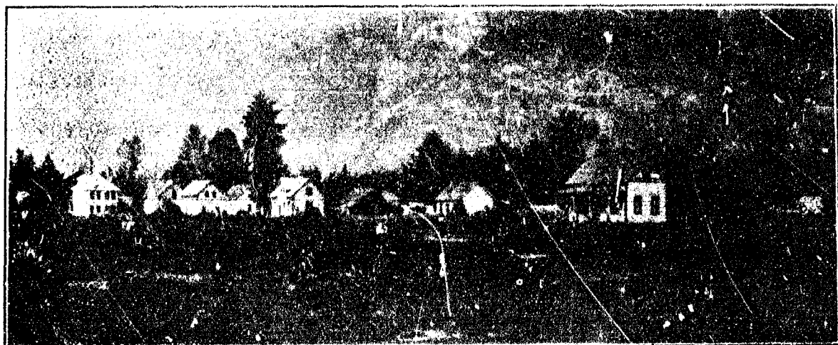
BELLA COOLA INDIAN VILLAGE