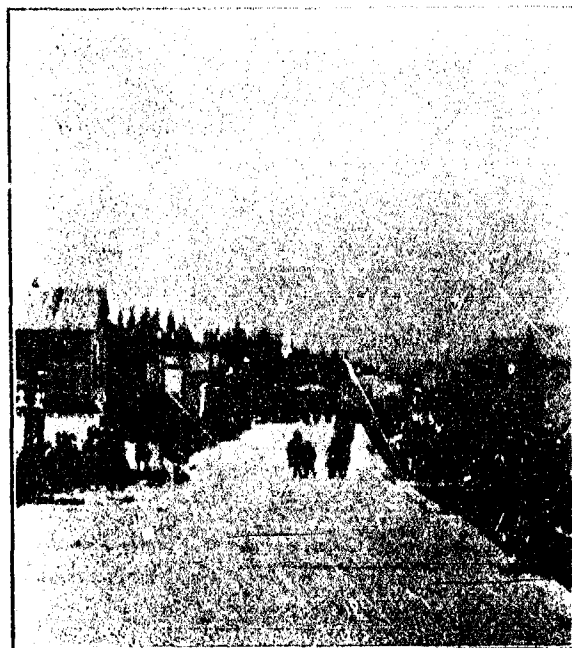
MAIN STREET, BELLA BELLA I. R.