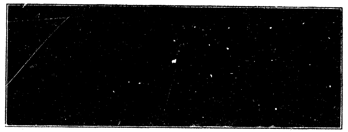
SINCLAIR HOT SPRINGS, DISCOVERED AND CLAIMED BY INDIANS