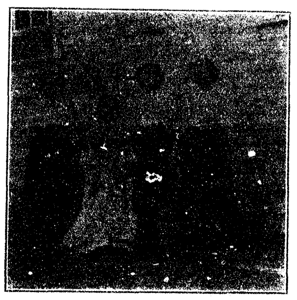
INDIANS OF THE KOOTENAY AGENCY