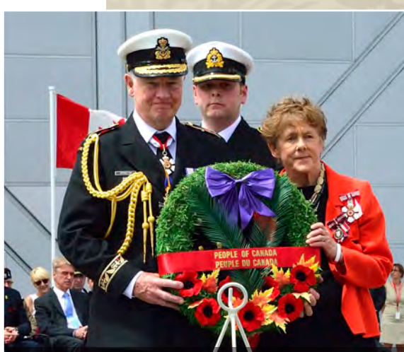
During a ceremony marking the 70<sup>th</sup> Anniversary of D-Day and the Battle of Normandy, Their Excellencies laid a wreath on behalf of the people of Canada, in memory of the more than 5 000 Canadians who sacrificed their lives in the name of freedom.