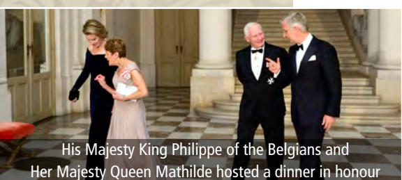
of Their Excellencies' visit in October.

The Governor General represents Canada at home and abroad, receiving visiting heads of State, conducting State visits abroad, accepting the credentials of foreign heads of mission and signing diplomatic documents.