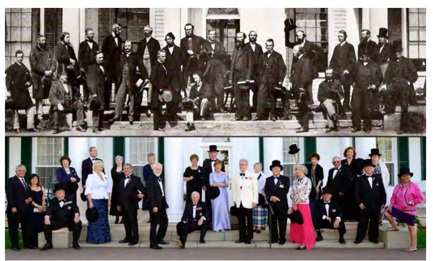
Participants of the annual conference of lieutenant governors and commissioners marked the 150<sup>th</sup> anniversary of the Charlottetown Conference by reproducing the historic Fathers of Confederation photo of 1864.