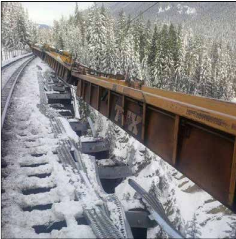
Photo 1. Derailed cars on the Stoney Creek Bridge (view looking west)

The weather at the time of the occurrence was cloudy, with a temperature of -10\text{ }^{\circ}\text{C} .