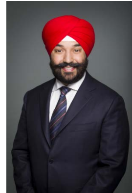
The Honourable Navdeep Bains Minister of Innovation, Science and Economic Development

The Prime Minister and the President of the Treasury Board are working to develop new, simplified and more effective reporting processes that will better allow Parliament and Canadians to monitor our Government's progress on delivering real change to Canadians. In the future, the Canadian Northern Economic Development Agency's reports to Parliament will focus more transparently on how we are using our resources to fulfill our commitments and achieve results for Canadians.