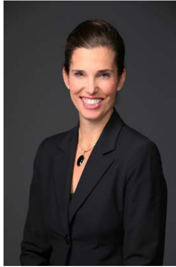
The Honourable Kirsty Duncan, Minister of Science