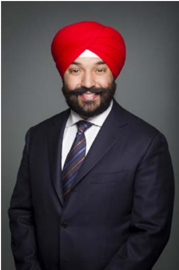
The Honourable Navdeep Singh Bains, Minister of Innovation, Science and Economic Development

We are pleased to present the 2014–15 Departmental Performance Report for the Social Sciences and Humanities Research Council.