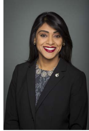
The Honourable Bardish Chagger, Minister of Small Business and Tourism