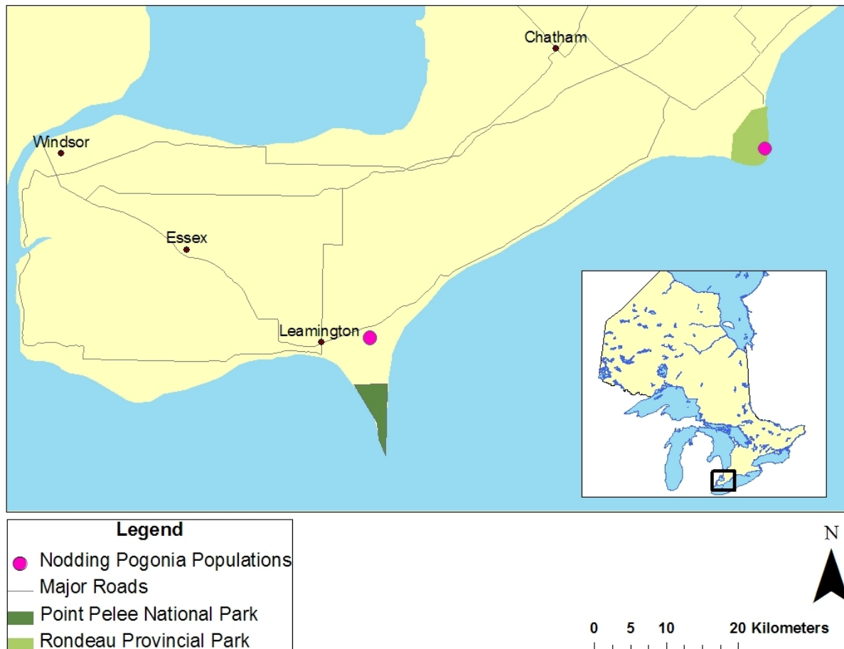
Figure 1. Current distribution of Nodding Pogonia in Ontario.

In Canada, Nodding Pogonia is restricted to two locations in Ontario: Rondeau Provincial Park in the Municipality of Chatham-Kent and Three Birds Woodlot, near Leamington in Essex County (Figure 1). Nodding Pogonia occurs throughout eastern North America (Figure 2) from New England to Texas, and south through Mexico, Guatemala, and Panama (NatureServe 2012). The species is globally ranked G3G4 or vulnerable to uncommon throughout its range, and the species is not ranked secure anywhere in North America (NatureServe 2012). Table 1 shows the conservation status of Nodding Pogonia in North America by state or province. In Canada and in Ontario, Nodding Pogonia is designated endangered. It is ranked N1 and S1 or critically imperiled both nationally and provincially.