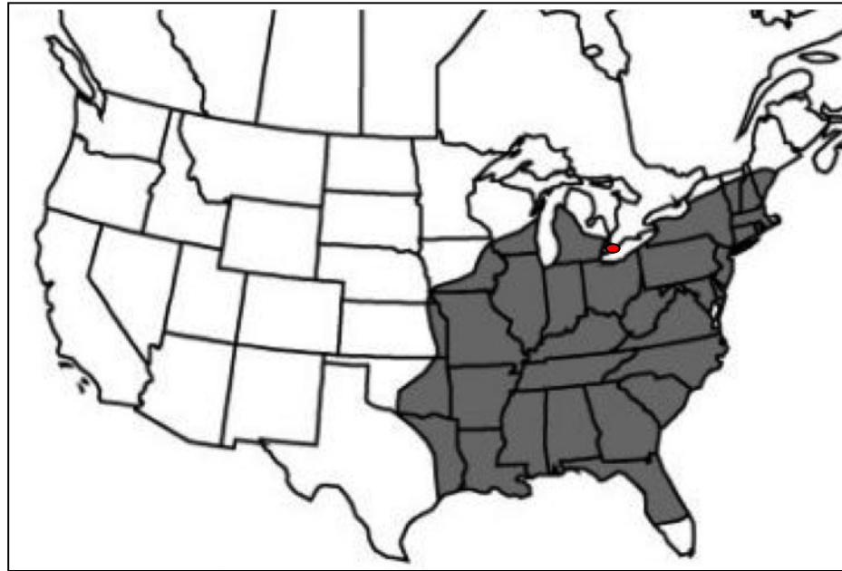
Figure 2. North American distribution of Nodding Pogonia (Flora North America 2005). Red dot shows general location of Ontario populations. Distribution in Mexico, Guatemala, and Panama not shown.