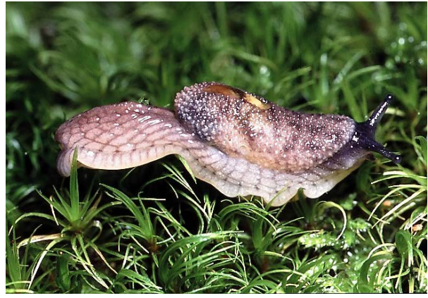
Figure 2. Warty Jumping-slug (Mount Brenton, Vancouver Island, 2001).