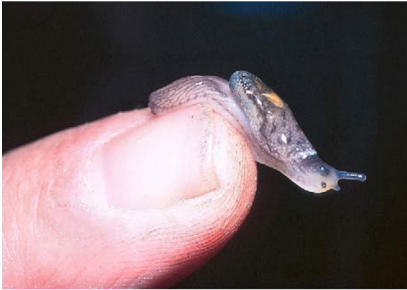
Figure 1. Warty Jumping-slug (Carmanah Valley, Vancouver Island, 2000).

Warty Jumping-slug is one of seven described species of jumping-slugs endemic to western North America (family Arionidae: genus Hemphillia ) (Turgeon et al. 1998). No subspecies of Warty Jumping-slug have been recognized, but recent molecular studies have revealed much genetic fragmentation among populations from different geographic areas, suggesting the nominal species H. glandulosa may represent a complex of sister species (Wilke 2004).