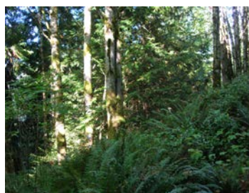
Figure 6. Moist second-growth habitat with red alder and bigleaf maple near East Sooke; Anderson Cove location. Note dense understory of sword fern.

This remnant patch was surrounded by recently harvested cutblocks. Five Warty Jumping-slugs were found within 2-person hours of intensive search. Several small creeks and pools of water were present in the patch. The forest floor was moist and contained abundant, layered coarse woody debris including large-diameter decaying logs.