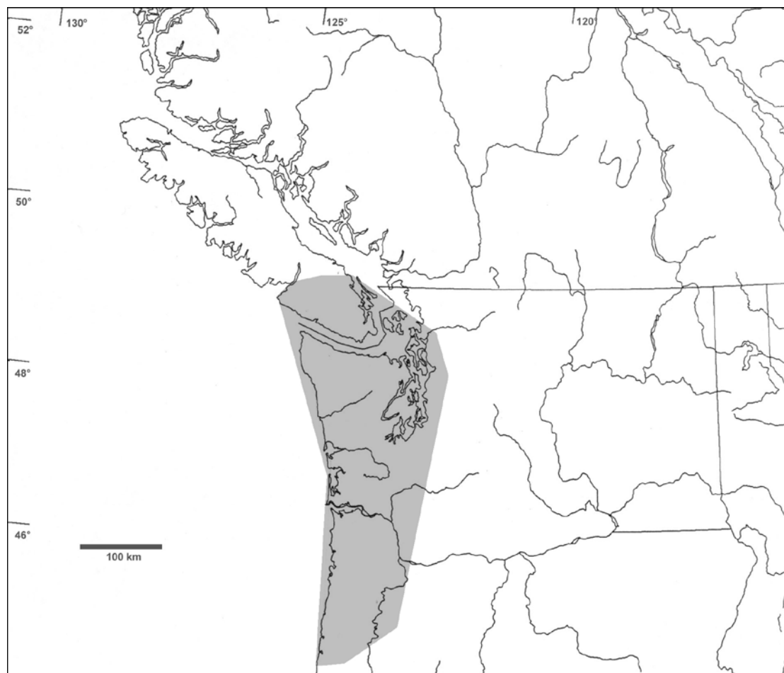
Figure 3. North American distribution of Warty Jumping-slug (COSEWIC 2003).

In Canada, Warty Jumping-slug is known from the southern third of Vancouver Island (Figure 4). The estimated extent of occurrence in B.C. is approximately 4700 km 2 , but the area of occupancy is a small fraction of this range (about 20–100 km 2 ) although it cannot accurately be estimated at this time. As of September 2011, there are 16 extant locations 2 , most of which are on the west coast of Vancouver Island, from Barclay Sound south to Sooke Inlet (Table 1). Two locations on the east coast of Vancouver Island (Cowichan River and Nanaimo Lakes) are considered historic locations and because of lack of specific information pertaining to the exact spatial location, continued presence at these two locations is difficult to determine. No records exist from mainland B.C. (B.C. Conservation Data Centre 2011).