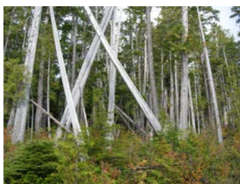
Figure 5. A remnant patch of western redcedar and western hemlock old-growth forest at Noyse Creek North, outside of Port Renfrew.

Both suitable forest structure and microhabitat conditions are essential for population persistence of Warty Jumping-slug over the long term. Key habitat features include moist forest floor conditions, abundant coarse woody debris, deep litter or moss layer that holds moisture, and shade provided by the forest canopy. Coarse woody debris at variable states of decay provides shelter, egg-laying sites, and a source of moisture for slugs. Across the landscape, suitable habitats must be connected to facilitate colonization of new habitats, repopulation of habitat patches from which the species might have disappeared, and genetic exchange that maintains variability and ability of populations to adapt to changing conditions. The dispersal ability of the Warty Jumping-slug is thought to be poor and is probably hindered by open habitats that do not maintain high humidity and moisture. Such habitats include recently logged areas and other disturbed habitats, especially at drier locations and within the heavily fragmented low-elevation coniferous forests of southern Vancouver Island.