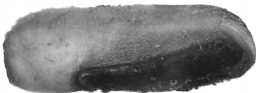
Scotian Shelf Northern Propellerclam