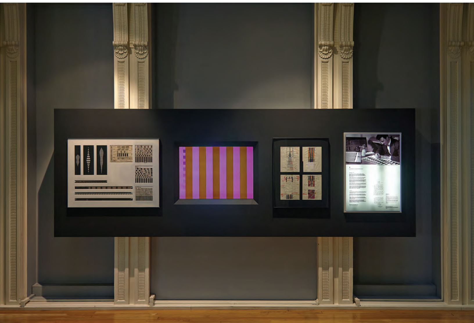
HAND-MADE CINEMA Exhibit at Talbot Rice Gallery, Edinburgh (Scotland)