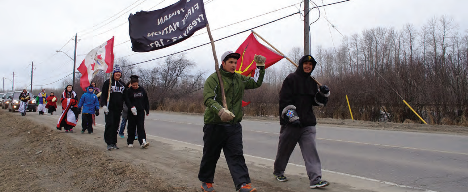
TRICK OR TREATY? Alanis Obomsawin