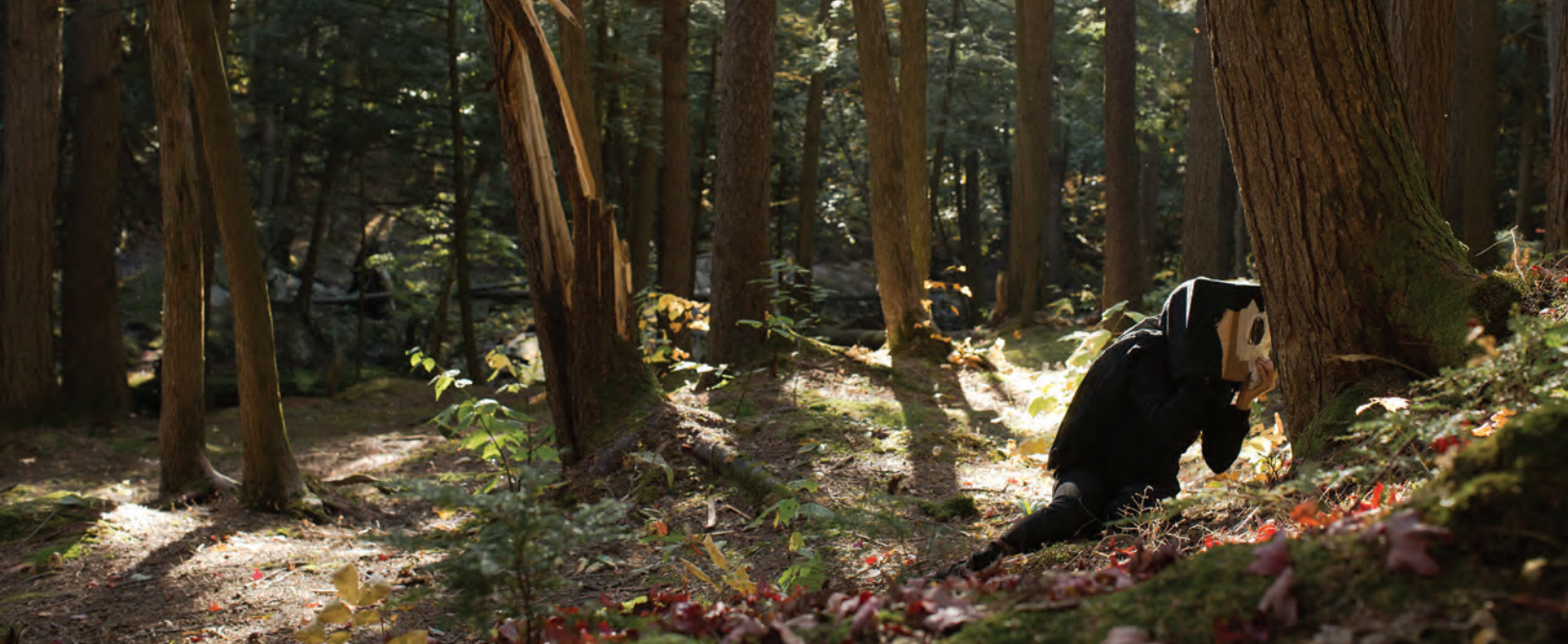
JUSQU'ICI ( Way to Go ), photo taken during production phase Vincent Morisset