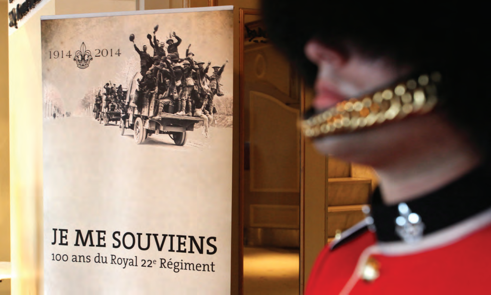
Screening of Claude Guilmain's JE ME SOUVIENS: 100 ANS DU ROYAL 22 e RÉGIMENT ( The Van Doos: 100 Years with the Royal 22 e Régiment ) at 100th-Anniversary Commemoration of WWI, Montreal