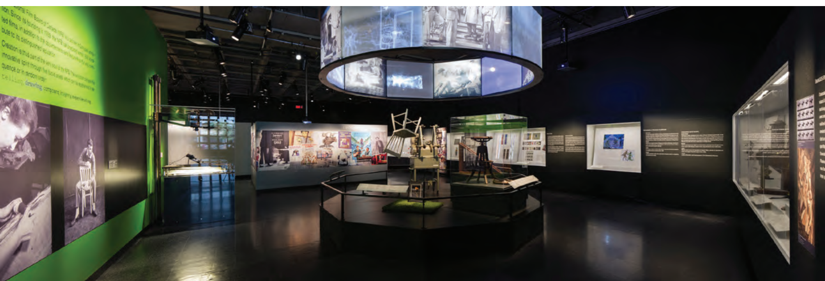
FRAME X FRAME: ANIMATED FILM AT THE NFB Exhibit at Musée de la civilisation, Quebec City Photo: Jessy Bernier, Perspective Photo, 0148_relv_0001