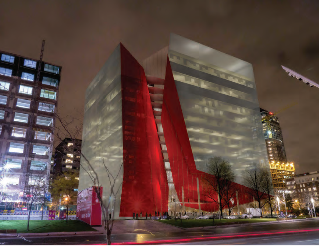
FUTURE HEADQUARTERS OF THE NFB Quartier des spectacles, Montreal