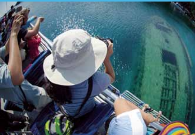
Fathom Five National Marine Conservation Area