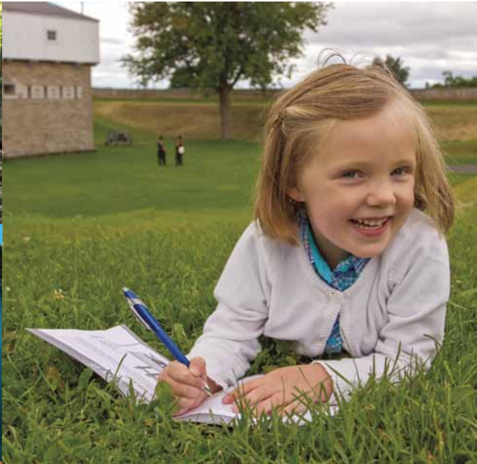
Fort Wellington National Historic Site