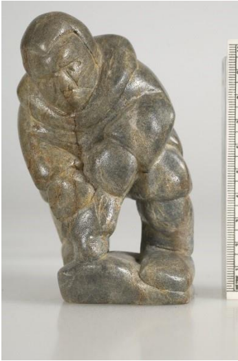
Figure 5. Iron pyrite inclusions are seen as rusty lines in the stone.

Stones from certain regions have iron pyrite inclusions. These inclusions have a rusty appearance and are found in seams in some types of stone used for carving (Figure 5). Iron pyrite inclusions can be problematic because they can begin to corrode in humid environments, causing splitting and staining. The corrosion products expand and can cause adjacent stone to split and spall. Sometimes, carvers will fill these areas of loss with epoxy resin adhesive, which can be seen on close inspection (Figure 6).