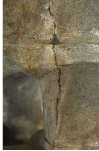
Figure 6. Fill material (probably epoxy resin) was used to fill an area of loss in the stone.

Some stone is quite porous and can be stained from the application of price tags or similar labels (Figure 7). Likewise, oils from hands can darken lighter areas of stone if they are handled or touched regularly.