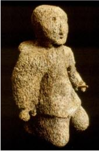
Figure 8. A carving made completely from the spongy area of whale bone is almost impossible to handle without damage.

Occasionally, a whale bone carving may still have some of the original oil in it. This is characterized by a very dark colouration of the marrow area and a somewhat putrid smell; in extreme cases, the oil can actually leak onto the surrounding surfaces. These problems are not easily dealt with and should be referred to a qualified conservator.