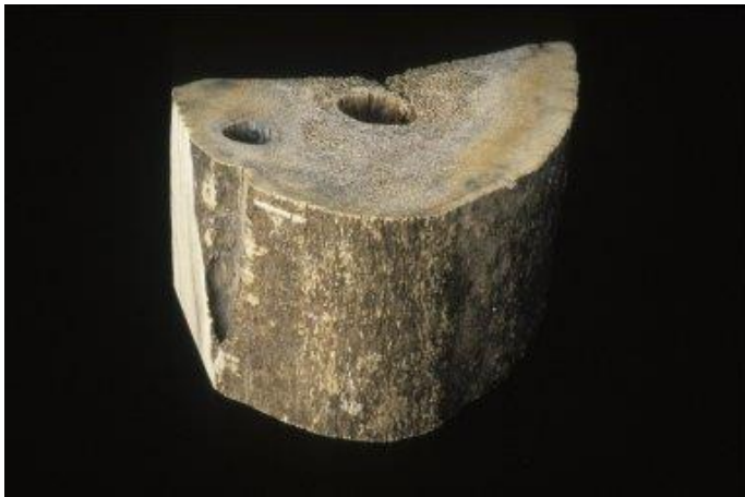
Figure 1. Whale bone showing spongy interior.

Whale bone, caribou bone, and antler are frequently used for carving by Inuit. Caribou bone and antler are generally used for smaller carvings, while whale bone is most frequently used for mid-size and larger carvings. Bone consists primarily of inorganic materials that provide strength and rigidity. Bone also has a soft organic component, which provides the capacity for growth and repair during the animal's lifetime (consult CCI Note 6/1 Care of Ivory, Bone, Horn, and Antler ). This organic component has usually deteriorated long before the bone was carved. Bone has a spongy central portion where the marrow resides. In whale bone carvings in particular, this area can be very large (Figure 1).