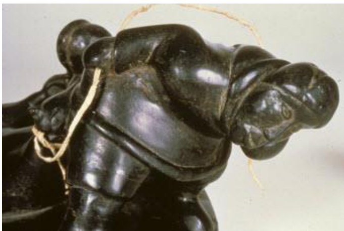
Figure 10. Stone carving showing a fragile skin thong.

The associated materials can sometimes be more fragile than the main material of the carving. It is important to take them into account, especially when handling sculptures or doing any sort of surface cleaning.