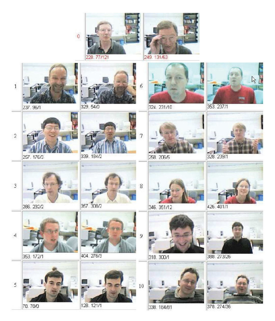
Figure 2: Video clips in the NRC-FRiV data set (Figure reproduced from [7]). The numbers underneath the images indicate the number of frames in a clip (the first number) and the number of those of them where a face detected (the second number).

Minority Oversampling Technique (SMOTE) algorithm, which generates new instances for the smallest class in the data set. Particularly, SMOTE is used to execute over-sampling of the minority class by creating