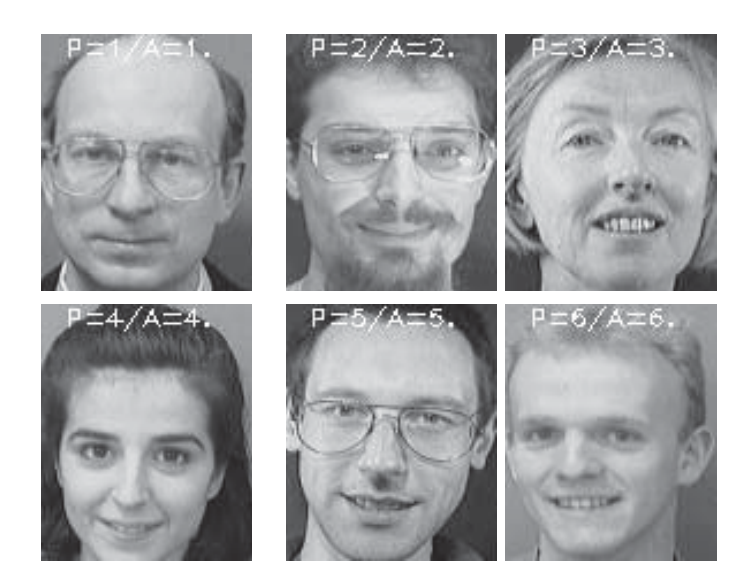
Figure 3: Facial images from the ORL database.

there will be a database with all faces that the algorithm must decide on. Due to these limitations, it was decided to use the algorithms implemented in Weka.